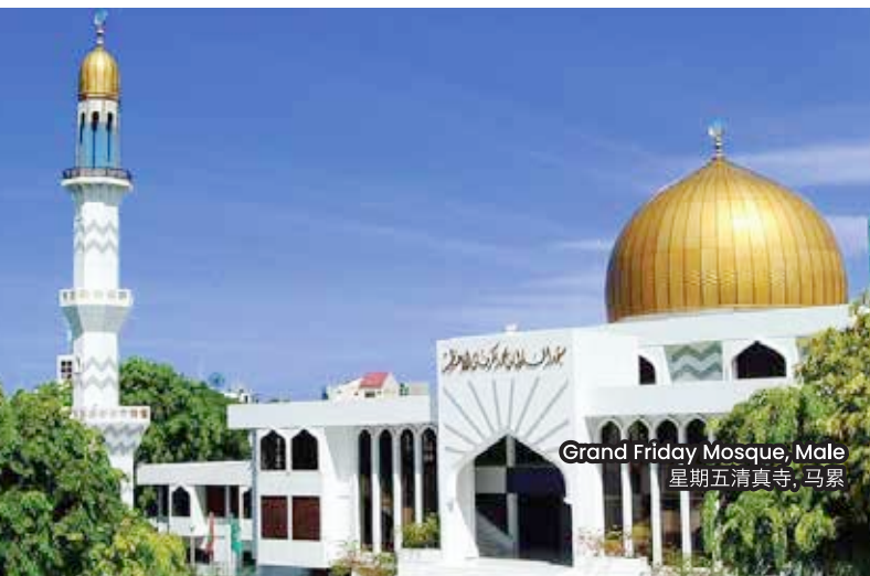
Grand Friday Mosque, Male 星期五清真寺, 马累

第05天 科伦坡 ✈️ 马累, 马尔代夫 (酒店早餐/自助晚餐) ✈️ 艾拉富士岛