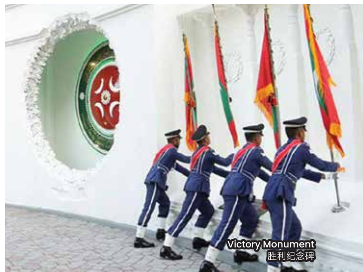
Victory Monument 胜利纪念碑