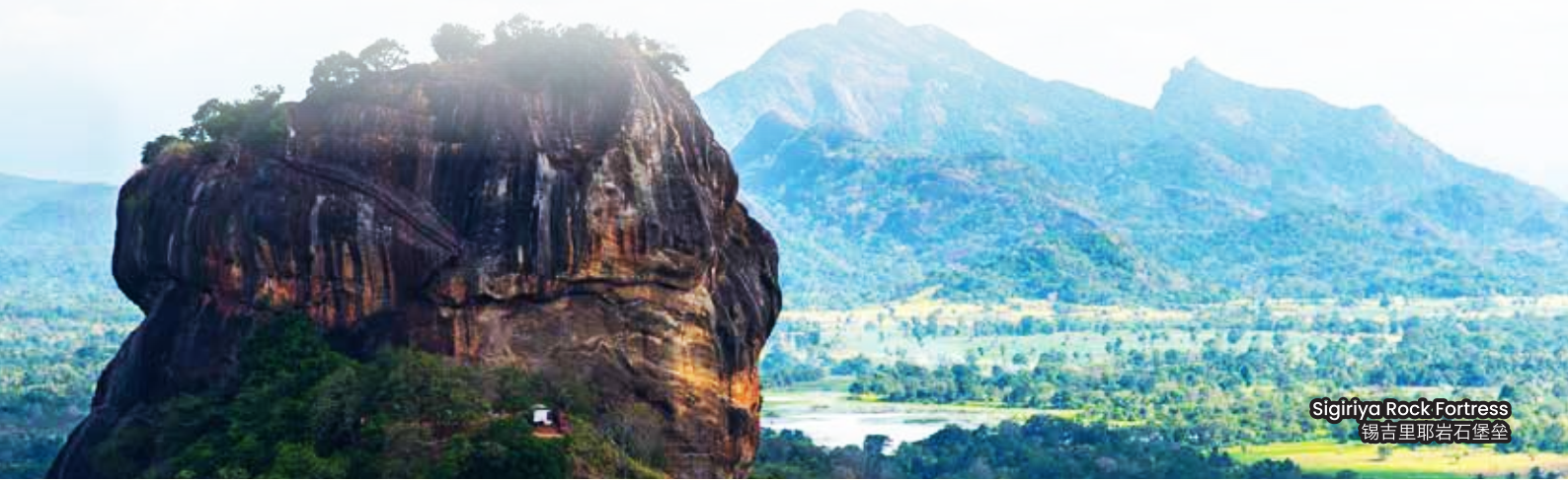
Sigiriya Rock Fortress 锡吉里耶岩石堡垒

愿您在斯里兰卡和马尔代夫，找到属于自己的那份平和与幸福。带着爱与感恩，旅途的点滴都将成为珍贵的记忆。