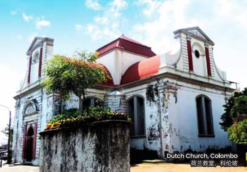
Dutch Church, Colombo 荷兰教堂, 科伦坡