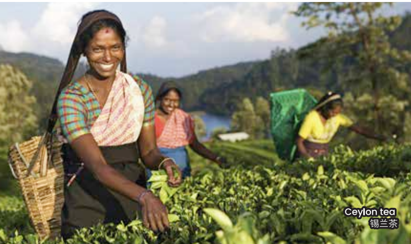
Ceylon tea 锡兰茶

佛牙寺供奉着佛牙圣物，是世界各地佛教徒最神圣的朝圣地之一。游客可以见证寺庙的日常仪式，包括点燃油灯和吟唱宗教诗。