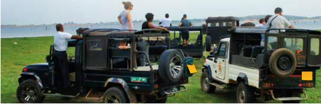
Minneriya National Park Minneriya 国家公园