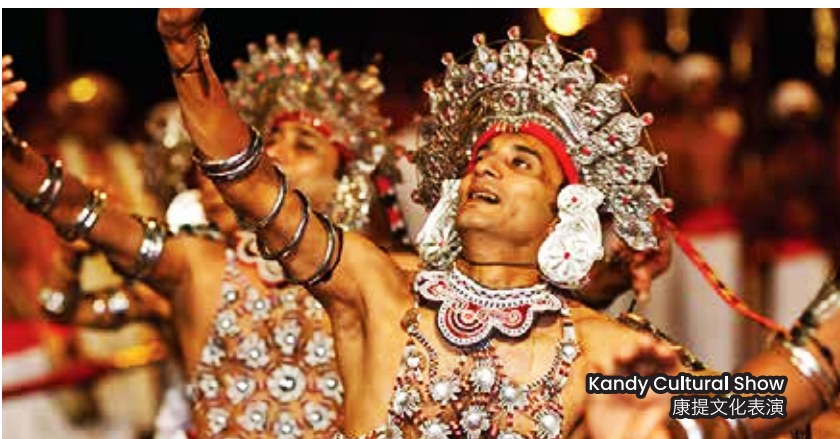
Kandy Cultural Show 康提文化表演