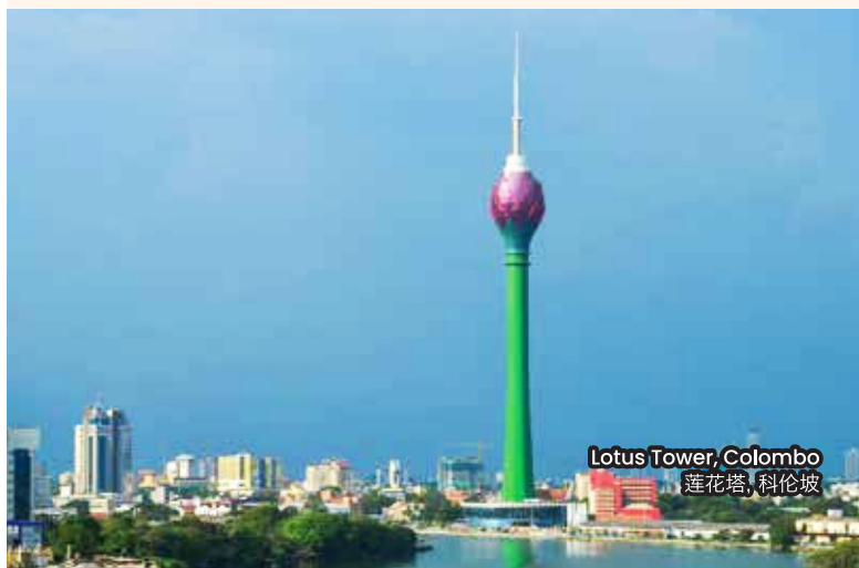
Lotus Tower, Colombo 蓮花塔, 科伦坡