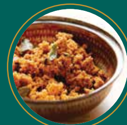
Pol Sambol 天海桑巴

Remarks/备注: All pictures in brochure are for illustration purpose only/行程上的图片仅供参考