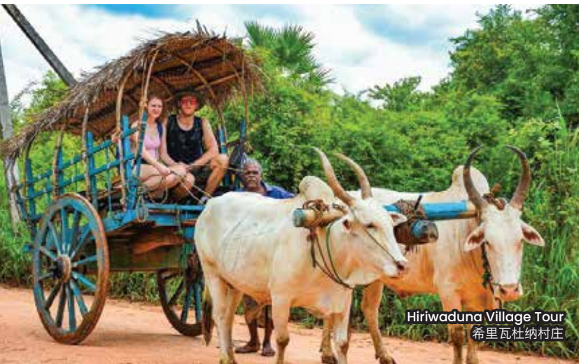
Hiriwaduna Village Tour 希里瓦杜纳村庄

锡兰茶一直是该国主要和最著名的出口产品。几代人以来，它一直是斯里兰卡经济的支柱，在国家收入中起着重要作用。参观 Giragama茶厂 ，深入了解茶叶生产。