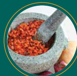
Lunu Miris 咸辣醬