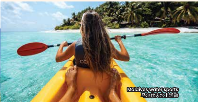
Maldives water sports 马尔代夫水上活动