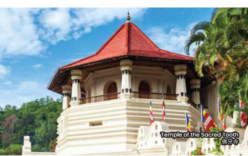
Temple of the Sacred Tooth 佛牙寺