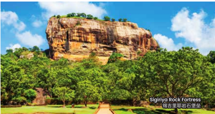
Sigiriya Rock Fortress 锡吉里耶岩石堡垒