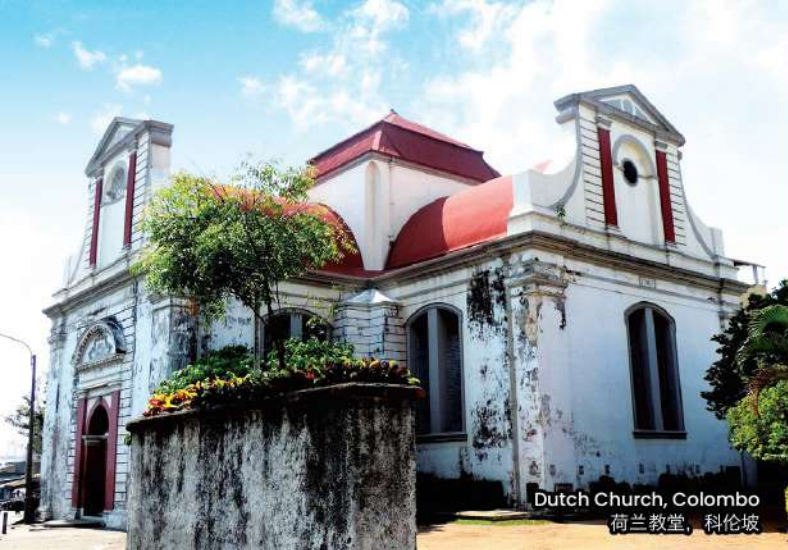
Dutch Church, Colombo 荷兰教堂, 科伦坡