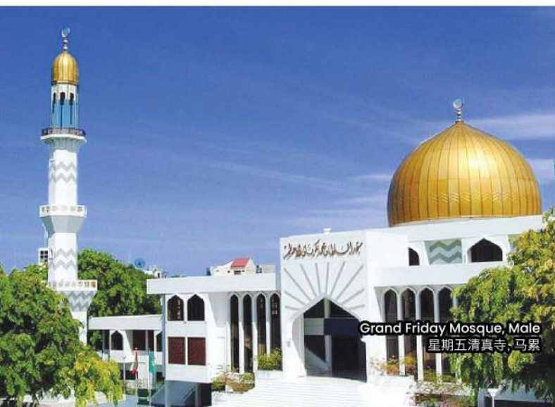
Grand Friday Mosque, Male 星期五清真寺, 马累

第05天 科伦坡 ✈️ 马累, 马尔代夫 (酒店早餐/自助晚餐) ✈️ 艾拉富士岛