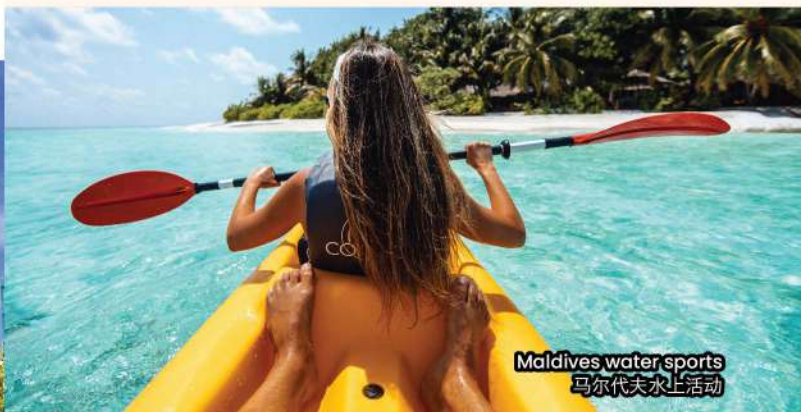
Maldives water sports 马尔代夫水上活动