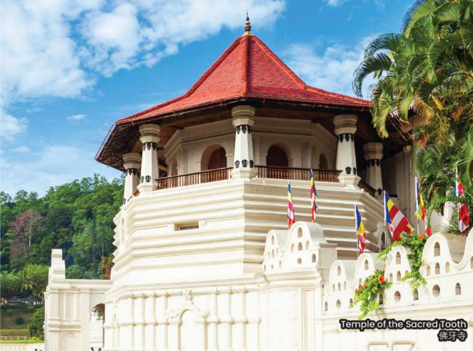
Temple of the Sacred Tooth 佛牙寺