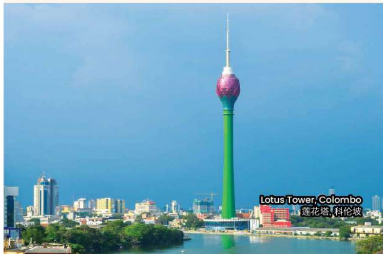
Lotus Tower, Colombo 蓮花塔, 科伦坡