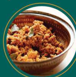
Pol Sambol 天海桑巴

Remarks/备注: All pictures in brochure are for illustration purpose only/行程上的图片仅供参考