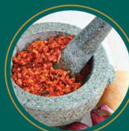
Lunu Miris 咸辣醬