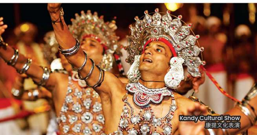
Kandy Cultural Show 康提文化表演