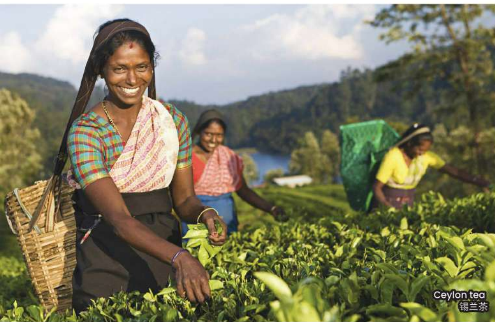
Ceylon tea 锡兰茶

佛牙寺供奉着佛牙圣物，是世界各地佛教徒最神圣的朝圣地之一。游客可以见证寺庙的日常仪式，包括点燃油灯和吟唱宗教诗。