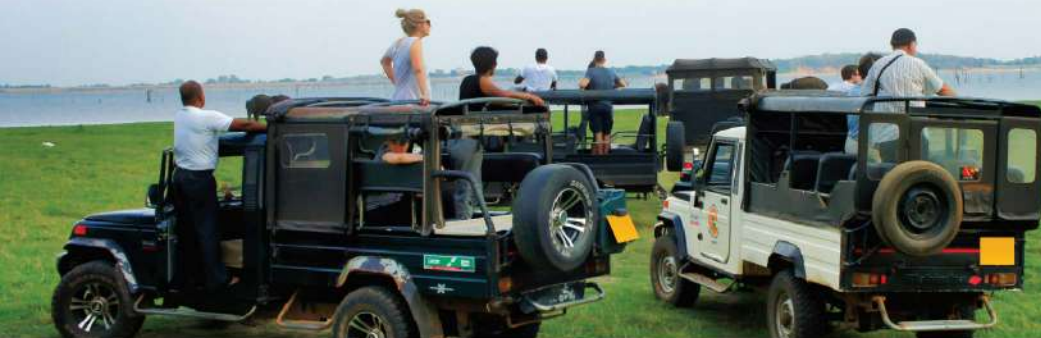
Minneriya National Park Minneriya 国家公园