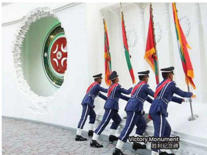
Victory Monument 胜利纪念碑