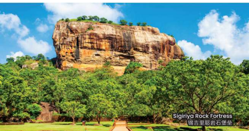
Sigiriya Rock Fortress 锡吉里耶岩石堡垒