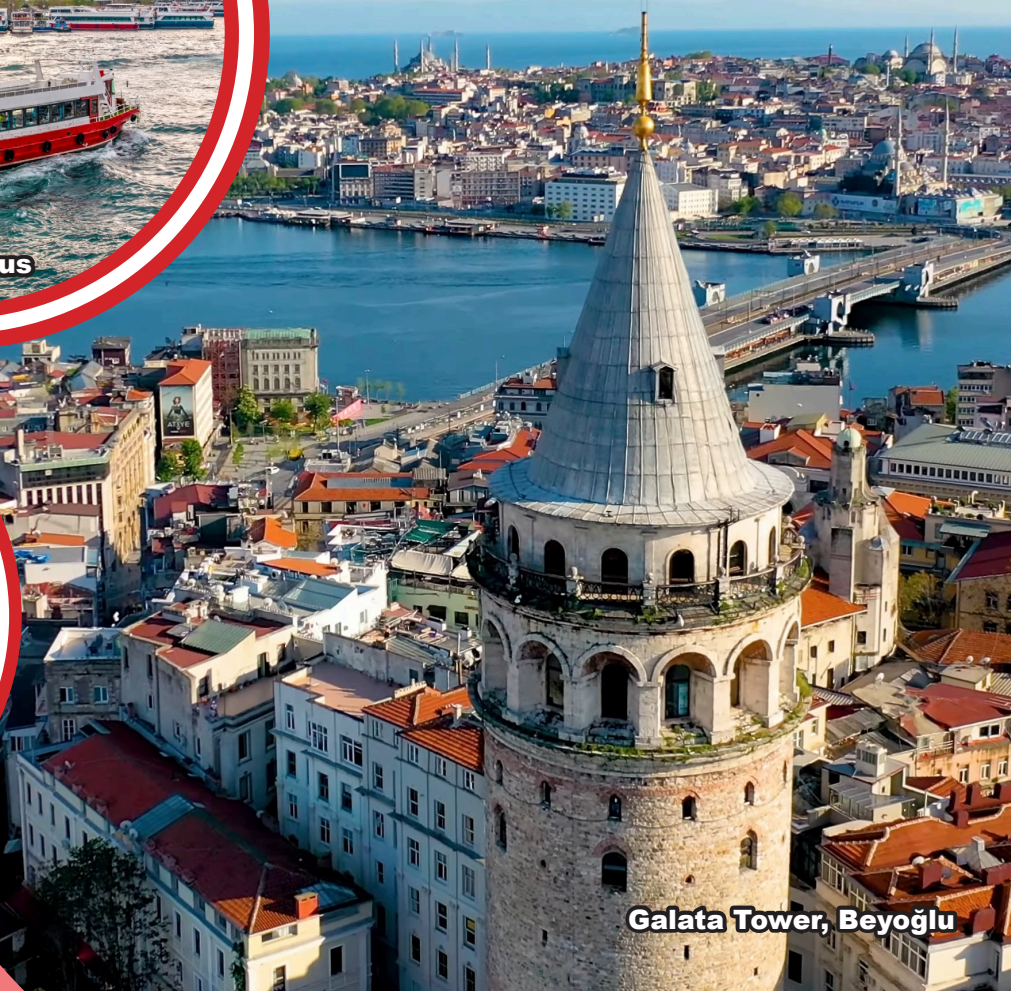
Galata Tower, Beyoğlu