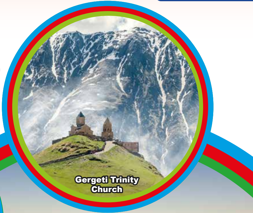
Gergeti Trinity Church