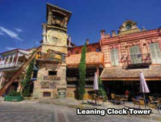
Leaning Clock Tower