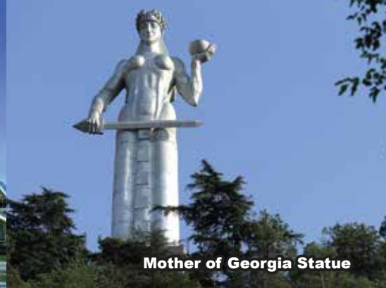
Mother of Georgia Statue