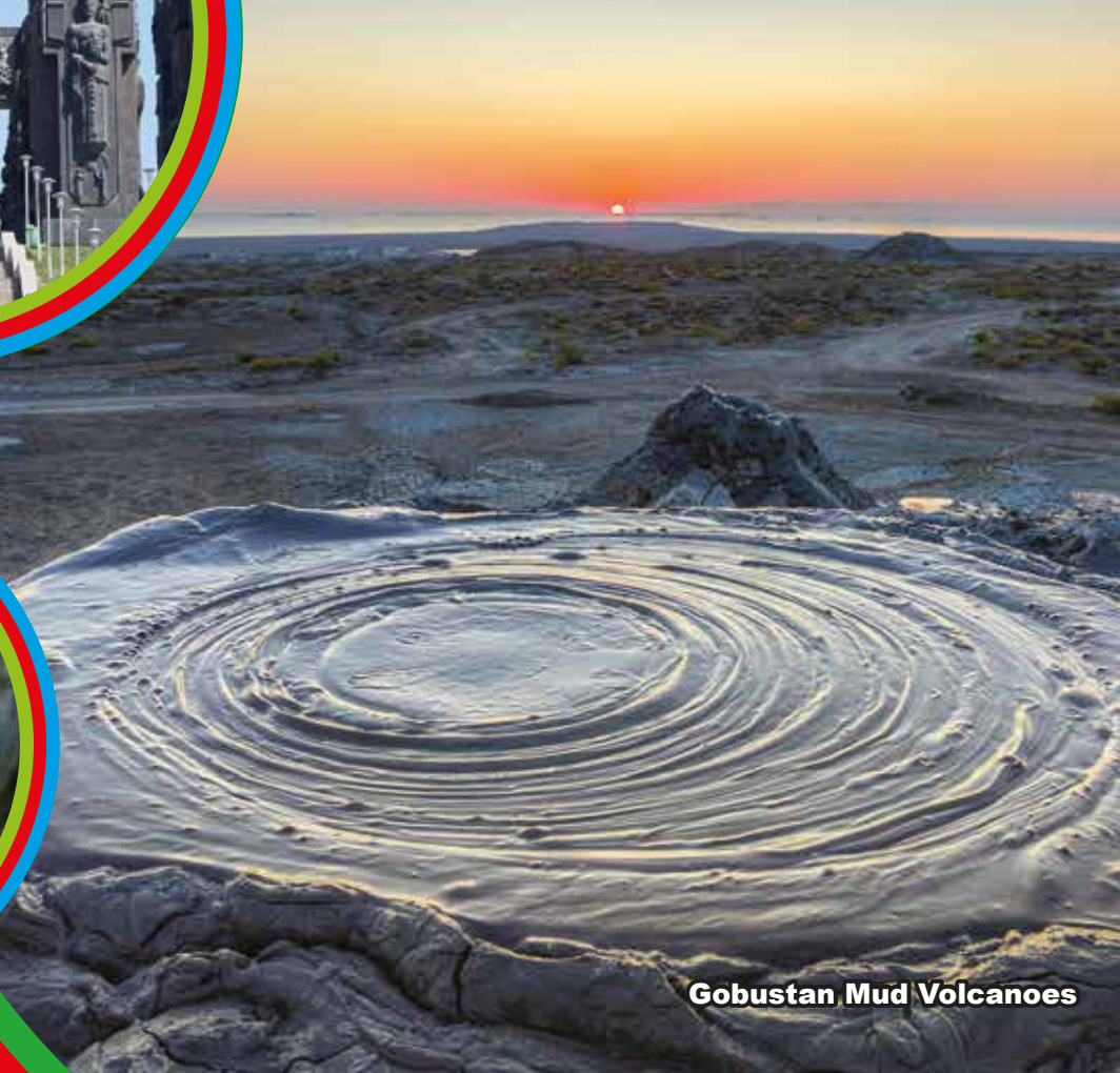
Gobustan Mud Volcanoes