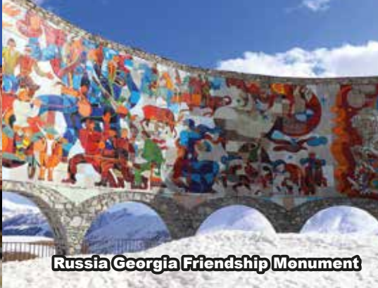
Russia Georgia Friendship Monument