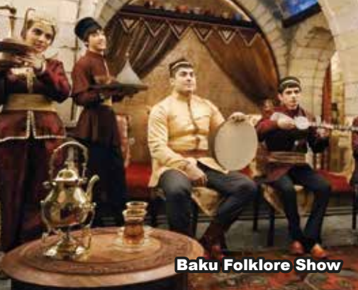
Baku Folklore Show