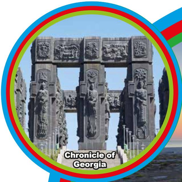
Chronicle of Georgia