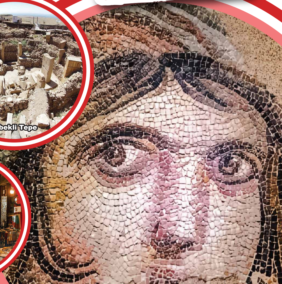
Zeugma Mosaic Museum