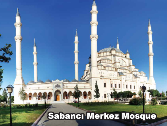
Sabancı Merkez Mosque