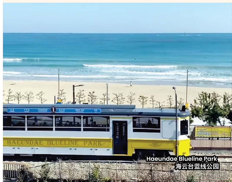
Haeundae Blueline Park 海云台蓝线公园

Sequences of itinerary are subject to local arrangement. Itineraries, meals, hotels and transportation are subject to change without prior notice.