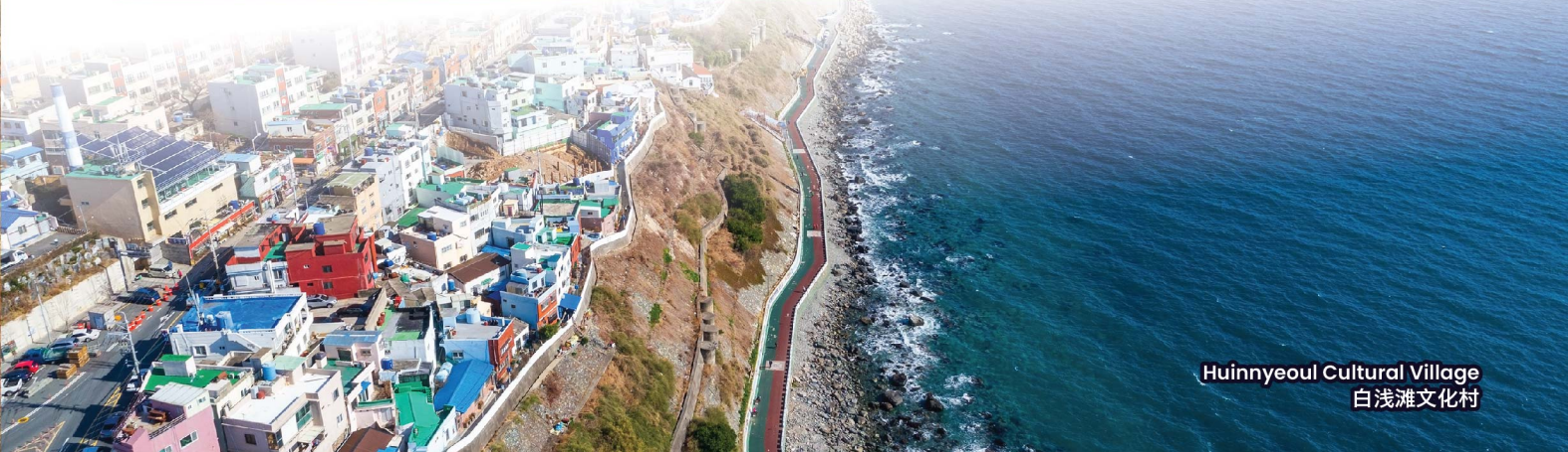
Huinnyeoul Cultural Village 白浅滩文化村