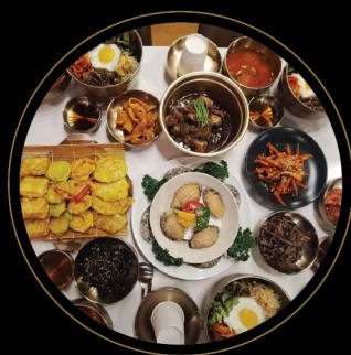
Hanok Special Set 韩屋特定套餐