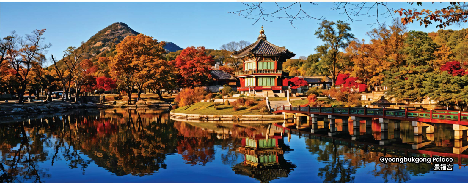
Gyeongbukgong Palace 景福宫

行程次序以当地旅行社安排为准。行程，膳食，住宿，交通等可能会因不可抗力因素而更动，恕不另行通知。