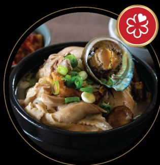
Abalone Ginseng Chicken Soup 鲍鱼人蔘鸡汤