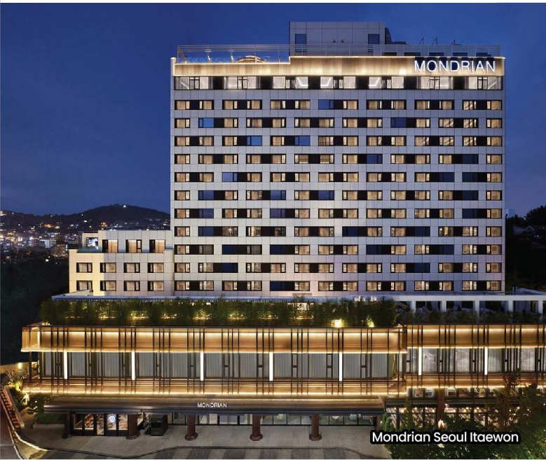
Mondrian Seoul Itaewon