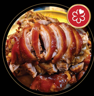
Pork Knuckle set 韩式炖猪蹄套餐

我们精选当地特色餐厅，而非传统的团体餐厅。美食不仅是味蕾的享受，更是文化的体验。入乡随俗，品味正宗韩国风味，在每一口之间感受地道的风土人情。