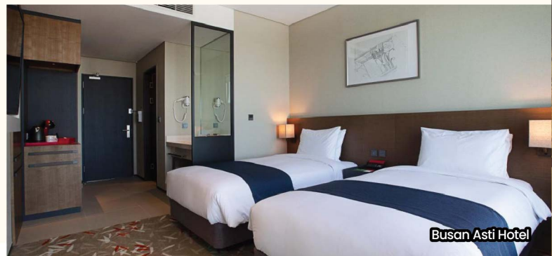
Busan Asti Hotel