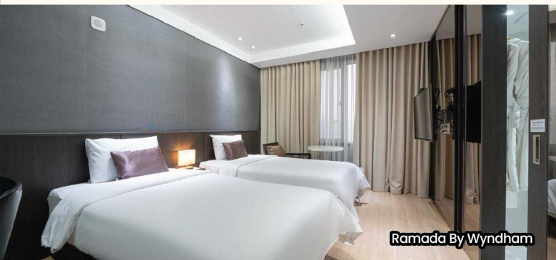
Ramada By Wyndham