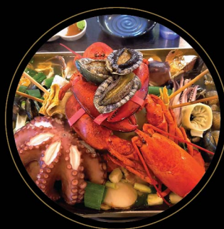
Emperor Submarine Seafood Pot 皇帝潜水艇海鲜锅