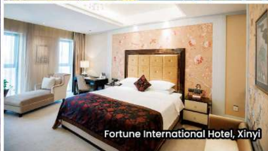
Fortune International Hotel, Xingyi