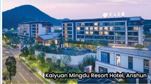
Kaiyuan Mingdu Resort Hotel, Anshun