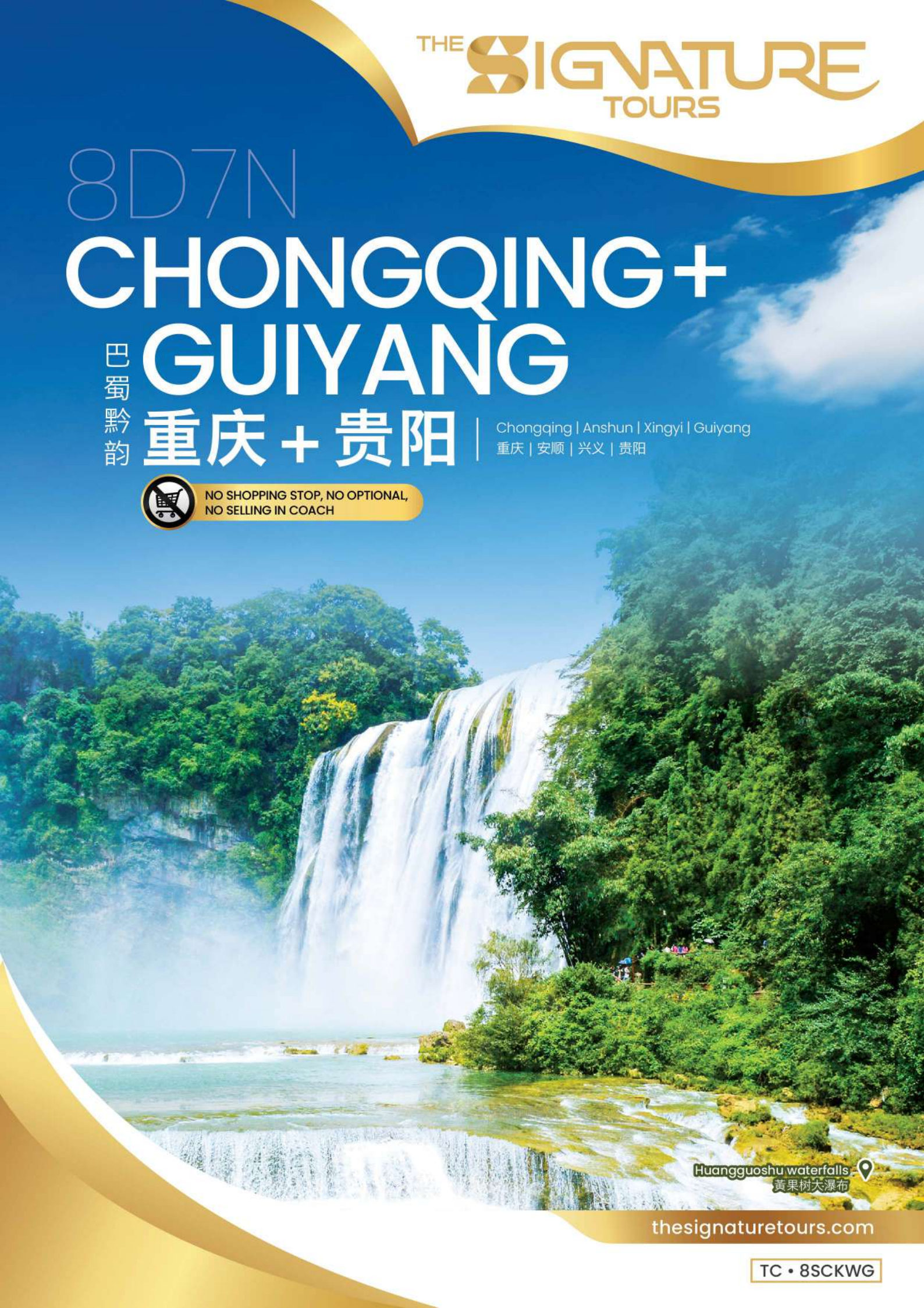
Huangguoshu waterfalls 黄果树大瀑布

NO SHOPPING STOP, NO OPTIONAL, NO SELLING IN COACH