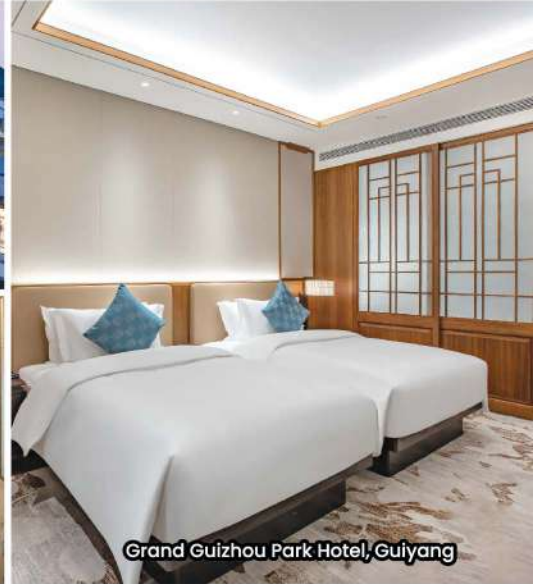
Grand Guizhou Park Hotel, Guiyang