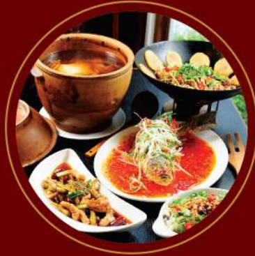
Qian Flavor 黔菜风味