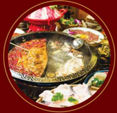
Mala Hot Pot 麻辣鸳鸯火锅