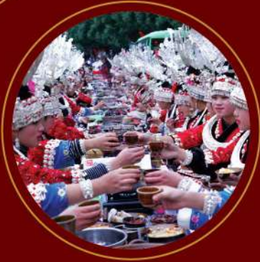
Long Table Feast of Miao 苗家长桌宴