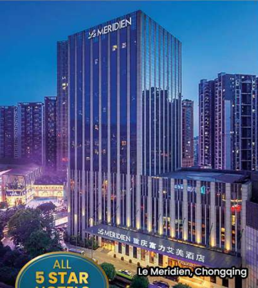
Le Meridien, Chongqing