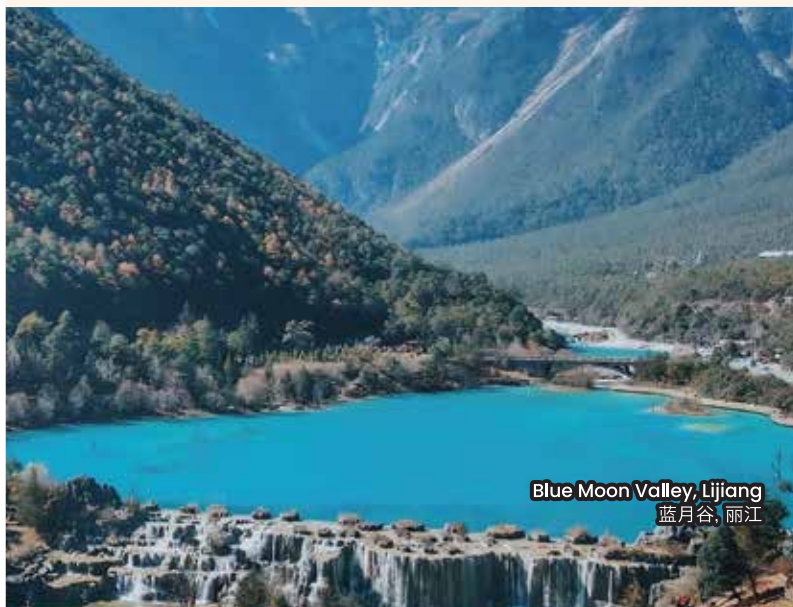
Blue Moon Valley, Lijiang 蓝月谷, 丽江