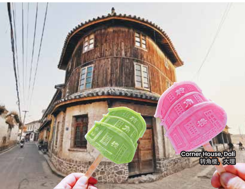
Corner House, Dali 转角楼, 大理