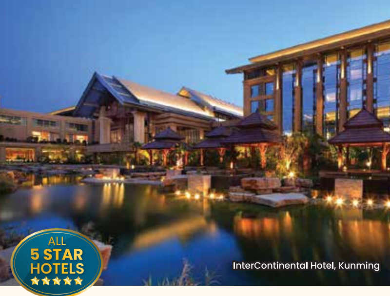
InterContinental Hotel, Kunming