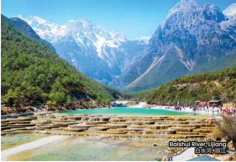
Baishui River, Lijiang 白水河, 丽江