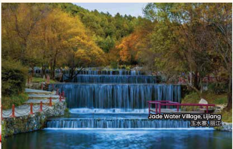
Jade Water Village, Lijiang 玉水寨, 丽江

行程次序以当地旅行社安排为准。行程, 膳食, 住宿, 交通等可能会因不可抗力因素而更动, 恕不另行通知。