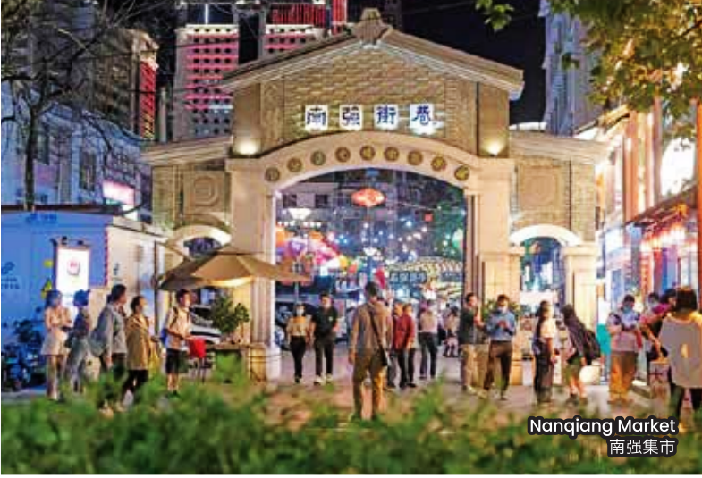
Nanqiang Market 南强集市