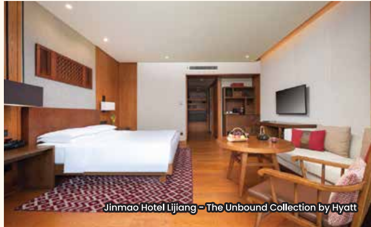
Jinmao Hotel Lijiang - The Unbound Collection by Hyatt