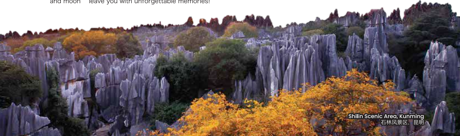
Shilin Scenic Area, Kunming 石林风景区，昆明