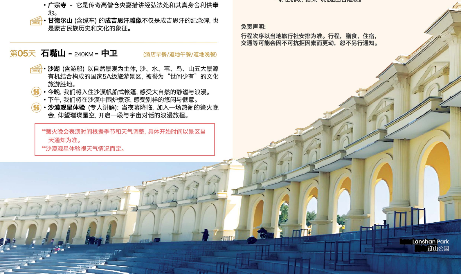
Lanshan Park 览山公园

行程次序以当地旅行社安排为准。行程, 膳食, 住宿, 交通等可能会因不可抗拒因素而更动, 恕不另行通知。