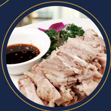
Hand-Grabbed Lamb 手抓羊肉

Hand-Grabbed is a medicinal diet with lamb waist and cilantro as the main ingredients. It has a history of nearly 1,000 years and is named after eating it with hands. In September 2018, was named one of the top ten classic dishes in ningxia.