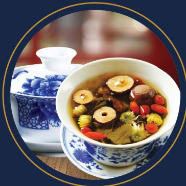
Babao Tea 八宝茶

手抓羊肉是以羊腰窝肉，香菜主料制作的药膳，相传手抓羊肉有近千年的历史，原以手抓食用而得名。2018年9月，被评为“中国菜”之宁夏十大经典名菜。