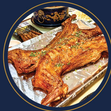
Roasted Whole Lamb 烤全羊

起源于唐朝的丝绸之路有着1300多年的历史。当时，来自各族群的商人互相交流、分享本地特产，将它们煮成茶，用以缓解旅途疲劳并结交新朋友。