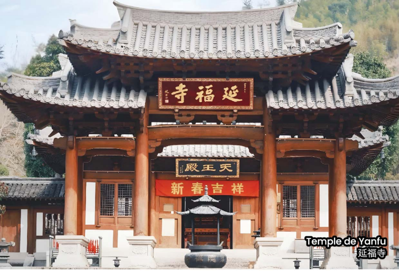
Temple de Yanfu 延福寺