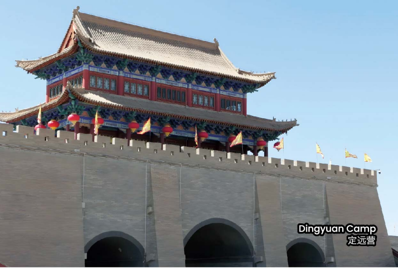
Dingyuan Camp 定远营