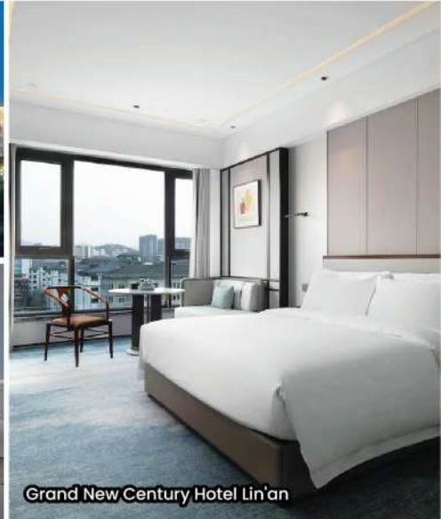
Grand New Century Hotel Lin'an