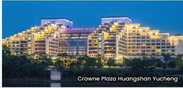
Crowne Plaza Huangshan Yucheng