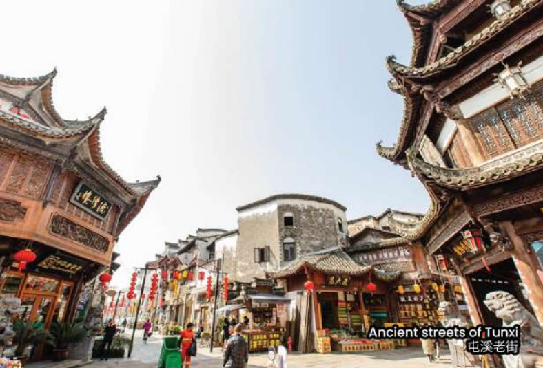
Ancient streets of Tunxi 屯溪老街