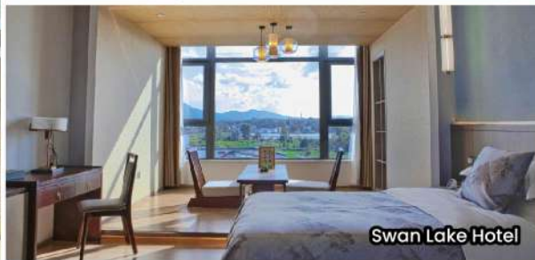
Swan Lake Hotel