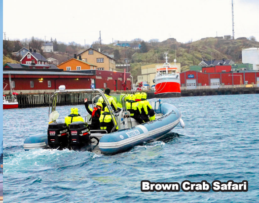
Brown Crab Safari