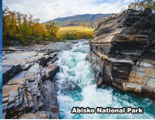
Abisko National Park