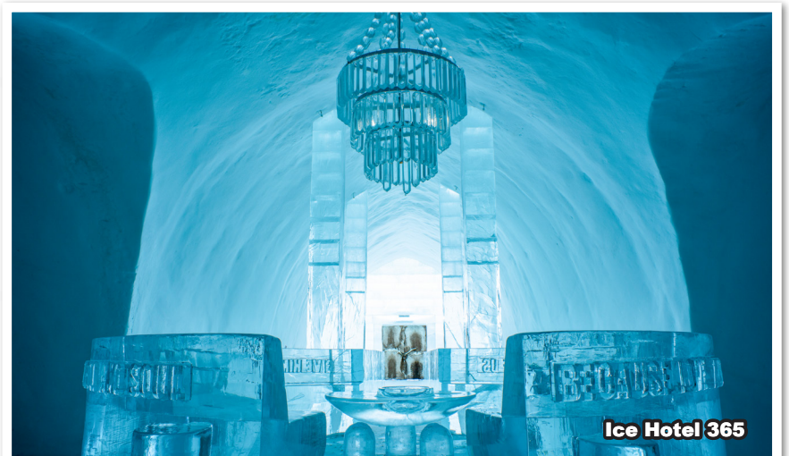
Ice Hotel 365