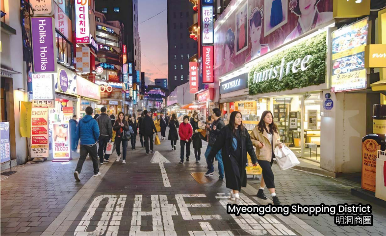
Myeongdong Shopping District 明洞商圈