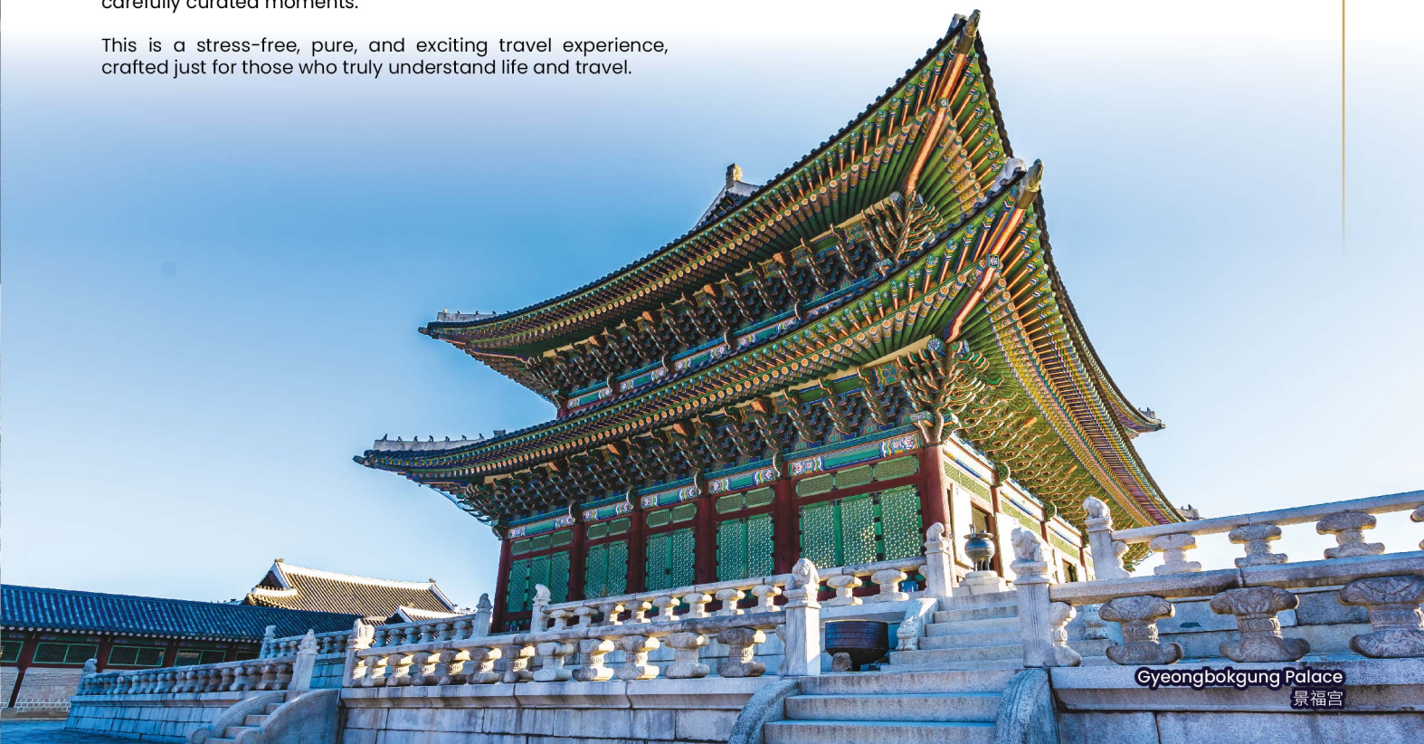
Gyeongbokgung Palace 景福宫