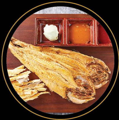
Grilled Pollack Set 烤鳕鱼套餐