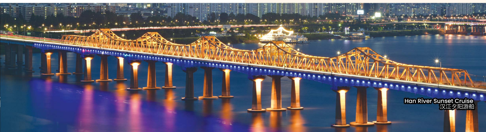
Han River Sunset Cruise 汉江夕阳游船

行程次序以当地旅行社安排为准。行程，膳食，住宿，交通等可能会因不可抗拒因素而更动，恕不另行通知。