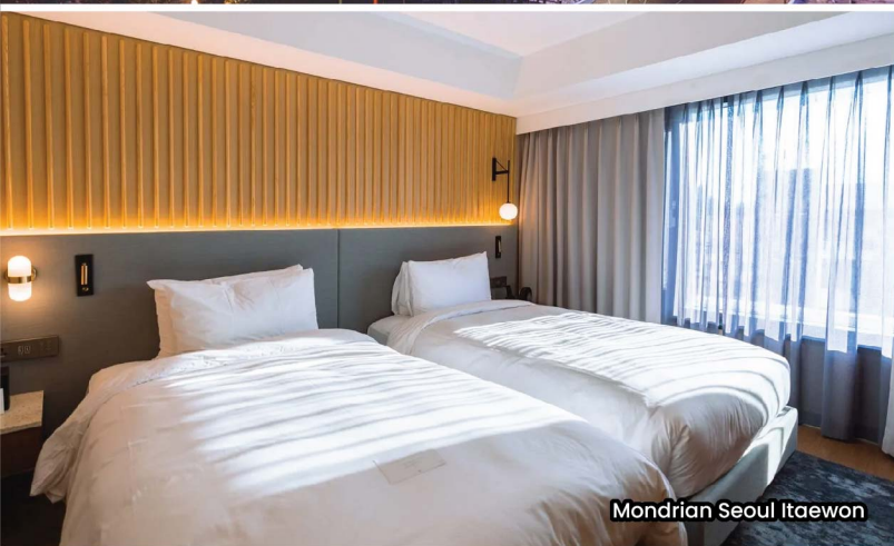
Mondrian Seoul Itaewon