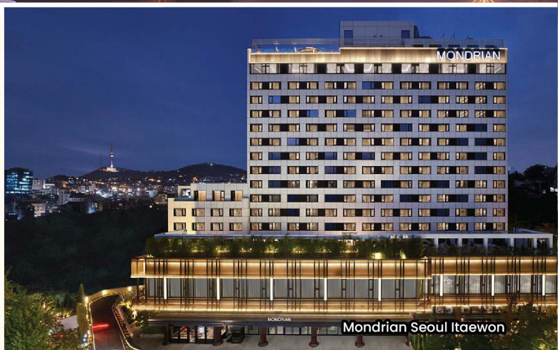
Mondrian Seoul Itaewon