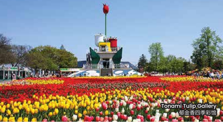
Tonami Tulip Gallery 郁金香四季彩馆