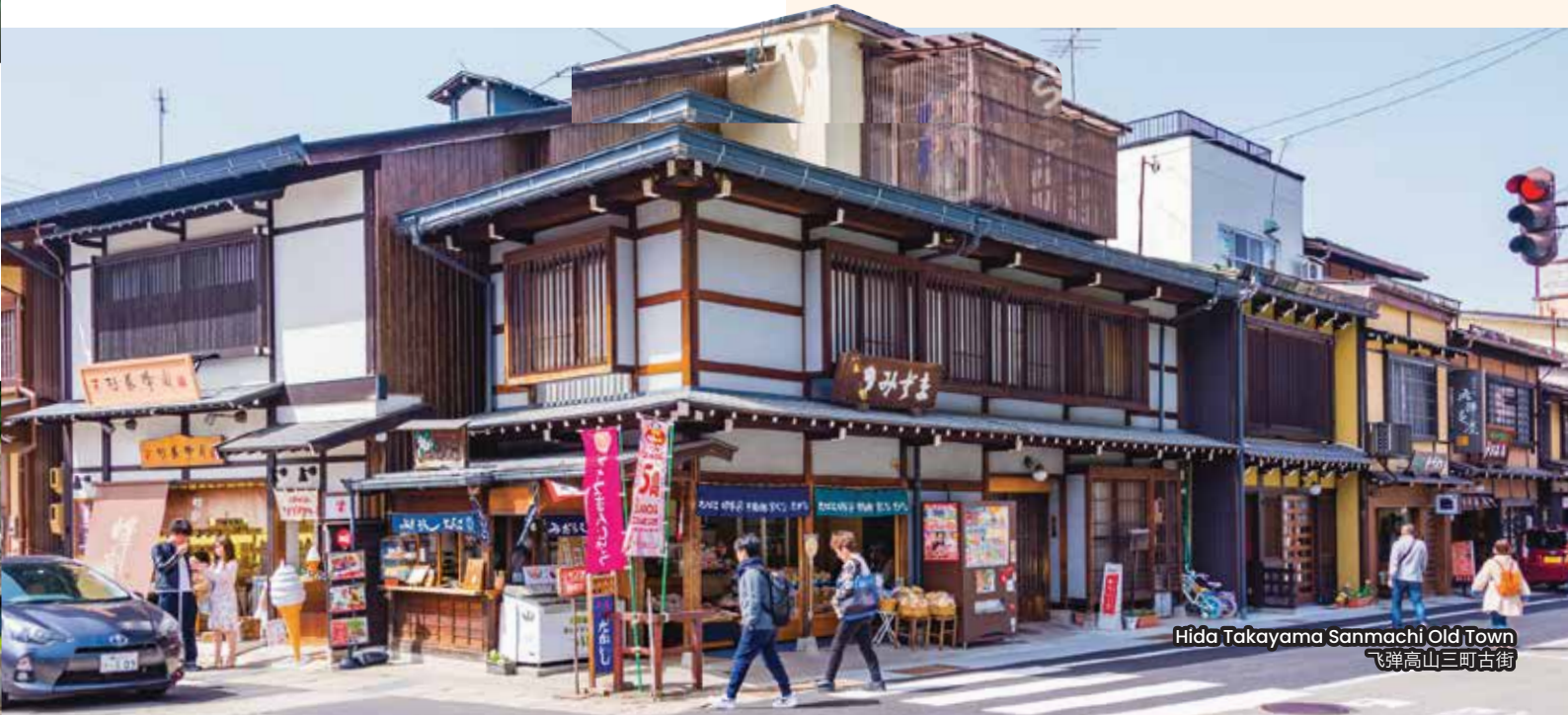
Hida Takayama Sanmachi Old Town 飞弹高山三町古街

Sequences of itinerary are subject to local arrangement. Itineraries, meals, hotels and transportation are subject to change without prior notice.