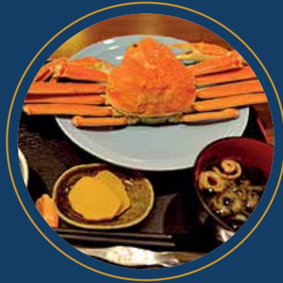
Whole Crab Delicacy 全只螃蟹美味