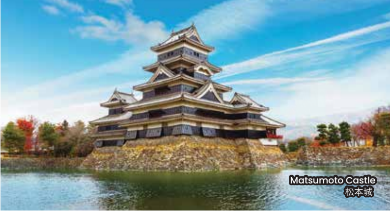
Matsumoto Castle 松本城

NAGOYA | GIFU | NAGANO | ISHIKAWA | TOYAMA