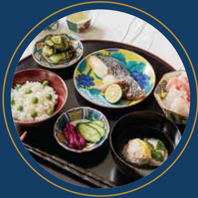
Rustic Japanese Set 日本乡村风味