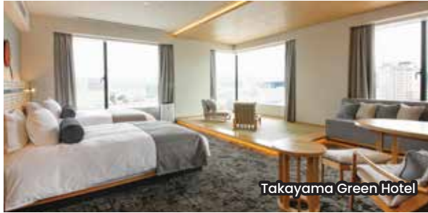
Takayama Green Hotel