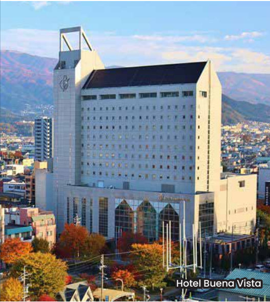
Hotel Buena Vista

Embark on a complete journey at 4-star hotel, offering a quality & comfortable stay. 全程安排四星级酒店, 让您在整个旅程中享受到有质量且舒适的住宿环境。