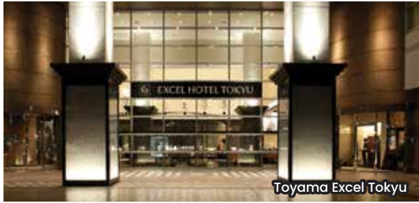
Toyama Excel Tokyu