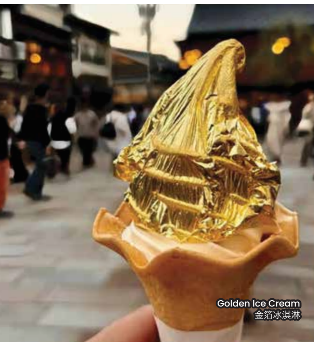
Golden Ice Cream 金箔冰淇淋

行程次序以当地旅行社安排为准。行程，膳食，住宿，交通等可能会因不可抗拒因素而更动，恕不另行通知。