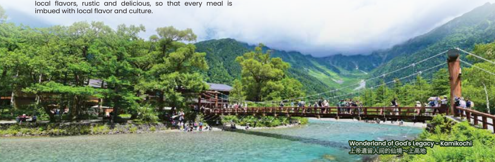
Wonderland of God's Legacy - Kamikochi 上帝遺留人间的仙境~上高地

我们为此次旅途精选了多家乡村地区的日式传统酒店，虽房间相对紧凑，但却能让您真正体验纯正的日本待客之道，体会生活中的精致细节。餐饮则以当地风味为主，质朴而美味，让每一餐都蕴含着地方的味道与文化。