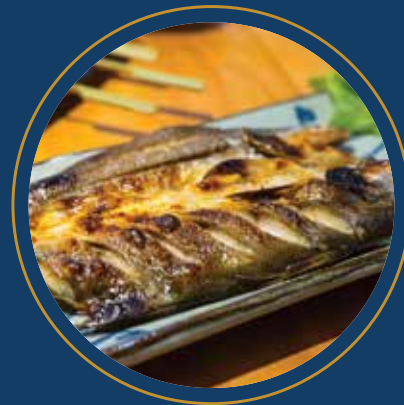
Grilled Fish Cuisine 香烤鱼套餐