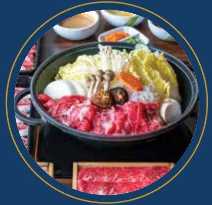
Shabu Shabu 日式涮涮锅