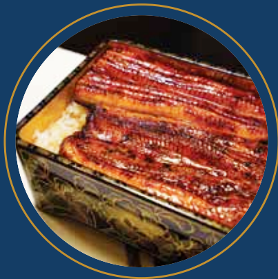
Classic Tateyama Unagi Rice 经典立山鳗鱼饭