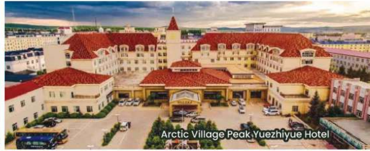
Arctic Village Peak Yuezhijue Hotel