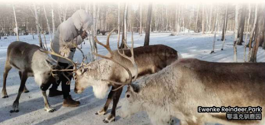
Ewenke Reindeer Park 鄂温克驯鹿园