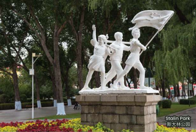
Stalin Park 斯大林公园