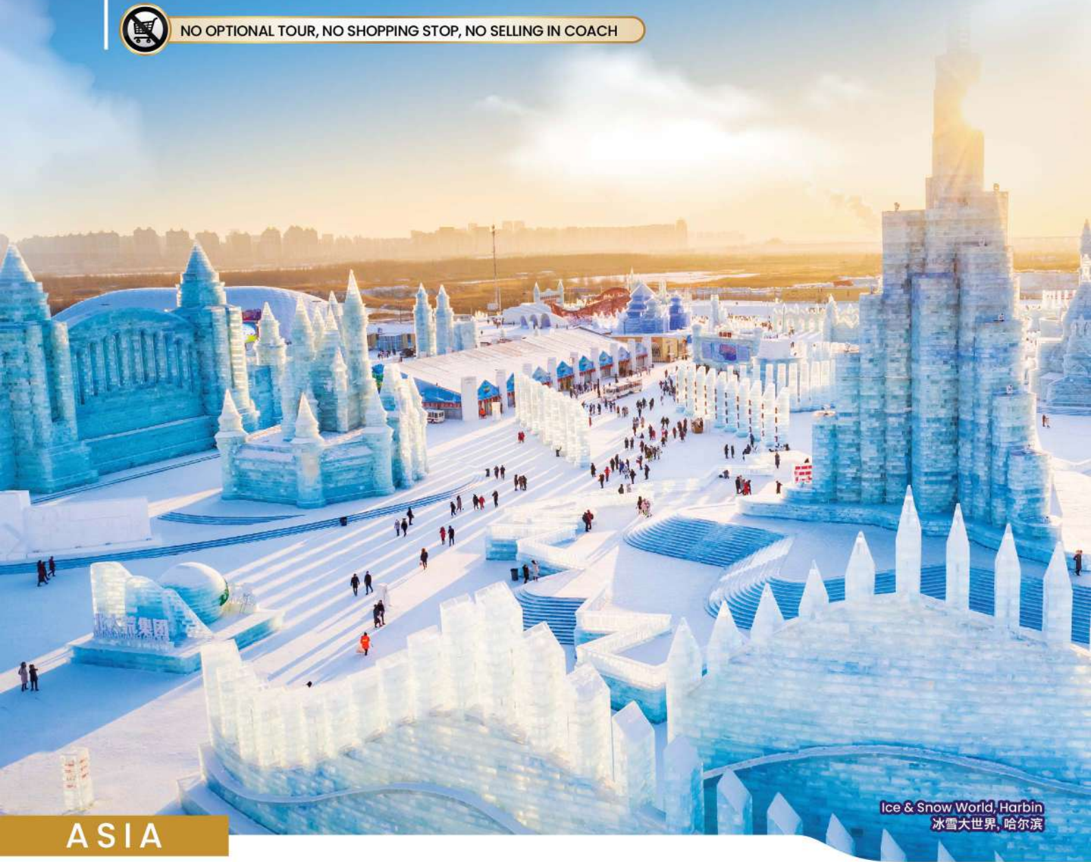
Ice & Snow World, Harbin 冰雪大世界, 哈尔滨

NO OPTIONAL TOUR, NO SHOPPING STOP, NO SELLING IN COACH