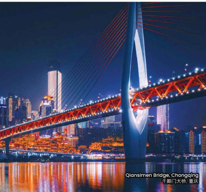
Qiansimen Bridge, Chongqing 千厮门大桥, 重庆

行程次序以当地旅行社安排为准。行程, 膳食, 住宿, 交通等可能会因不可抗力因素而更动, 恕不另行通知。