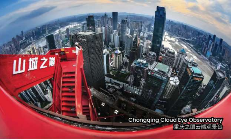
Chongqing Cloud Eye Observatory 重庆之眼云端观景台