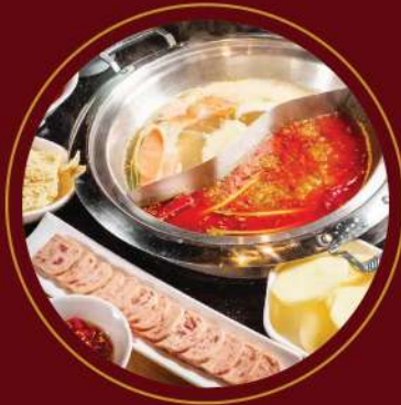
Yuanyang Mala Hot Pot 麻辣鸳鸯火锅