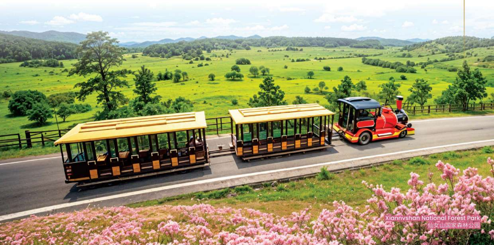
Xiannvshan National Forest Park 仙女山国家森林公园