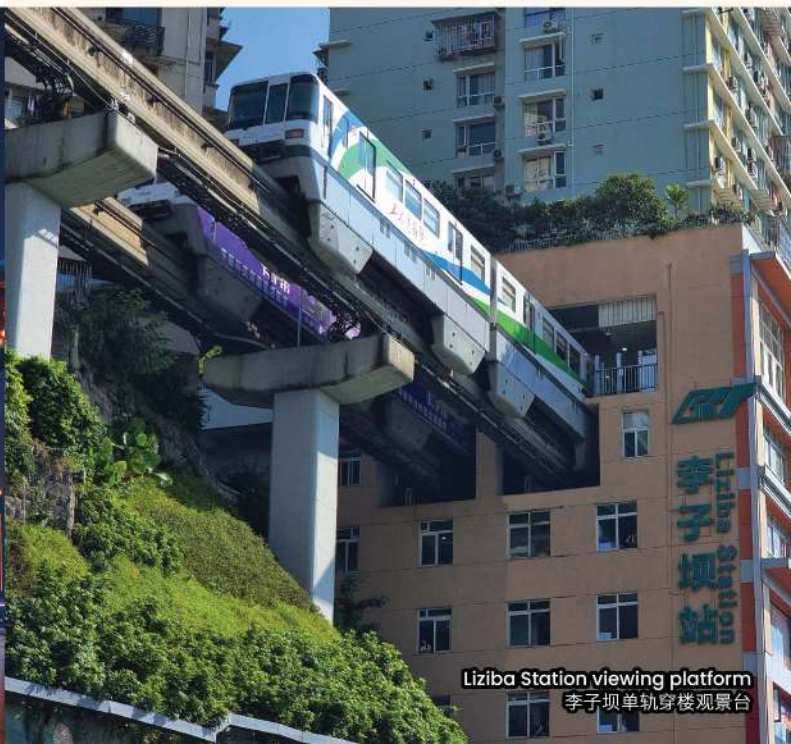
Liziba Station viewing platform 李子坝单轨穿楼观景台