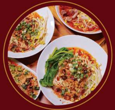
Chongqing Flavor 重庆风味