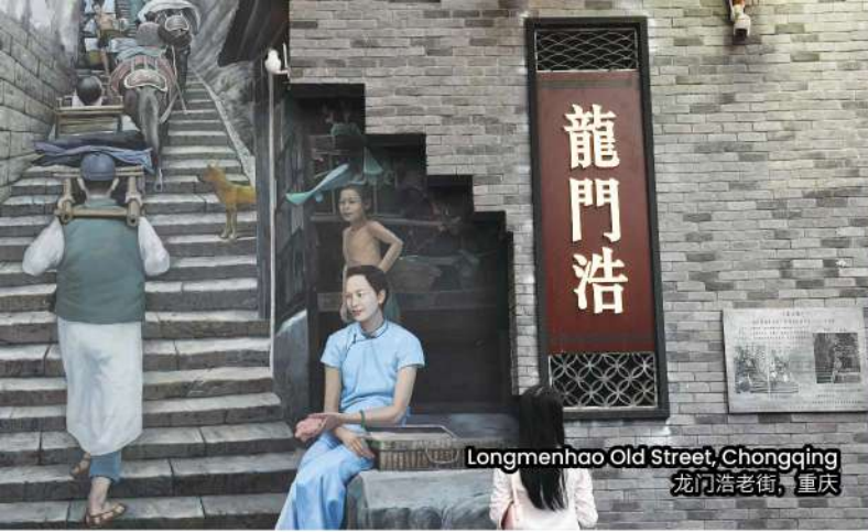
Longmenhao Old Street, Chongqing 龙门浩老街, 重庆