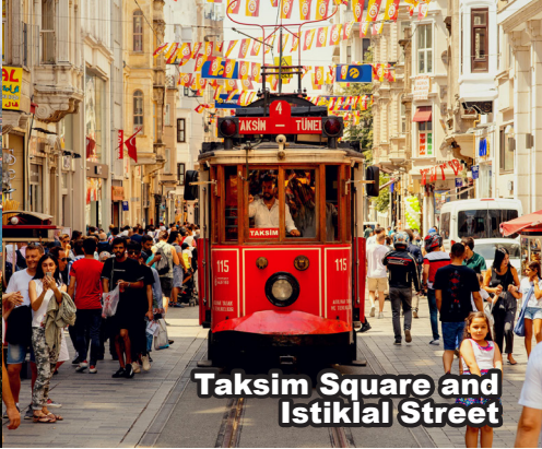
Taksim Square and Istiklal Street