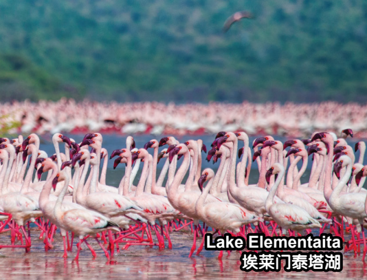
Lake Elementaita 埃莱门泰塔湖