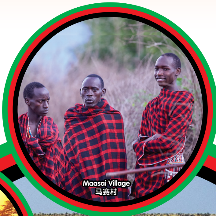
Maasai Village 马赛村