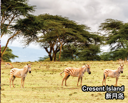
Crescent Island 新月岛