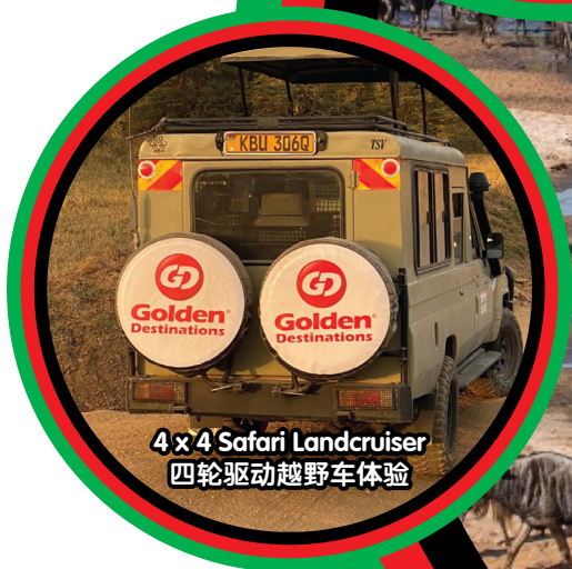
4 x 4 Safari Landcruiser 四轮驱动越野车体验