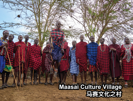
Maasai Culture Village 马赛文化之村