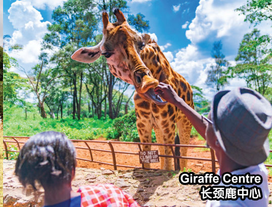
Giraffe Centre 长颈鹿中心