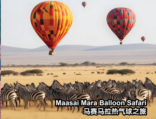
Maasai Mara Balloon Safari 马赛马拉热气球之旅