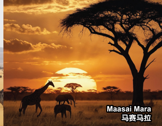
Maasai Mara 马赛马拉