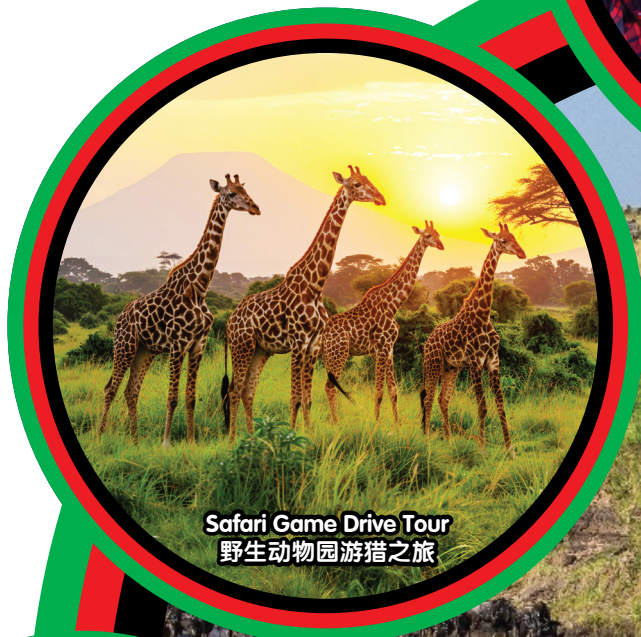
Safari Game Drive Tour 野生动物园游猎之旅