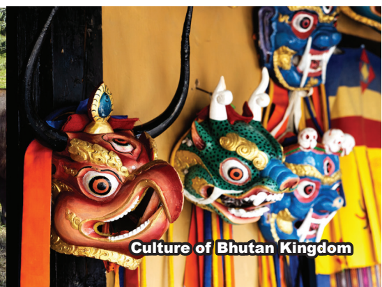
Culture of Bhutan Kingdom