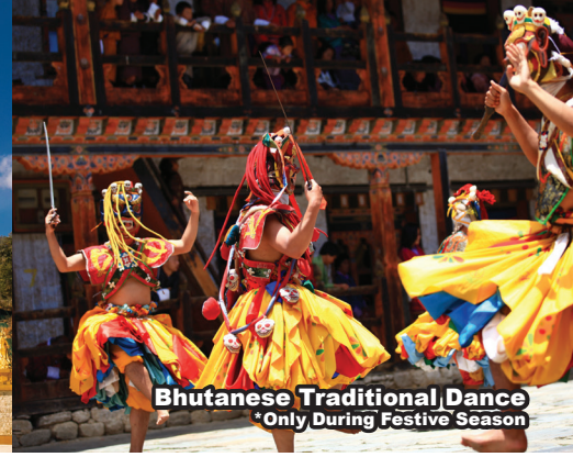
Bhutanese Traditional Dance *Only During Festive Season