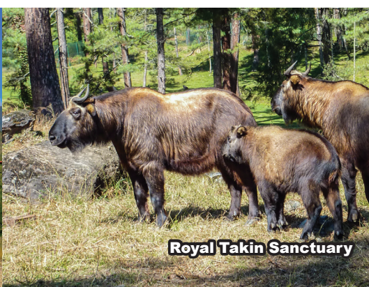
Royal Takin Sanctuary