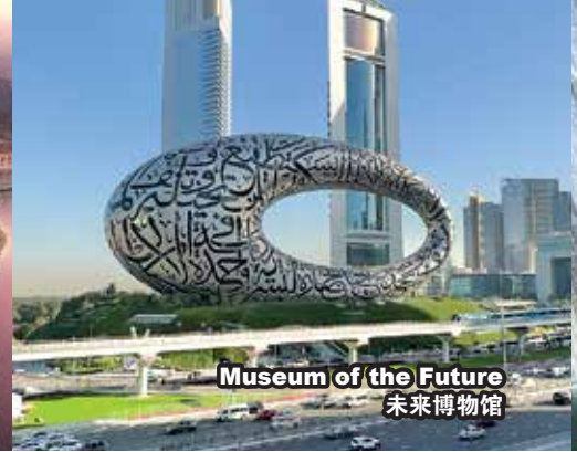
Museum of the Future 未来博物馆