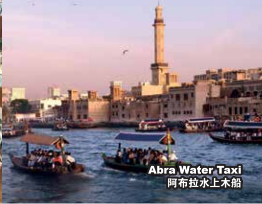
Abra Water Taxi 阿布拉水上木船