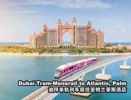
Dubai Tram-Monorail to Atlantis, Palm 迪拜单轨列车前往亚特兰蒂斯酒店