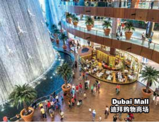
Dubai Mall 迪拜购物商场