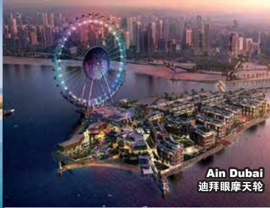
Ain Dubai 迪拜眼摩天轮