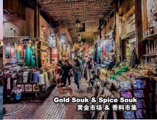
Gold Souk & Spice Souk 黄金市场 & 香料市集