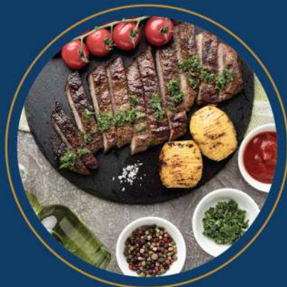
Argentina Steak 阿根廷牛排