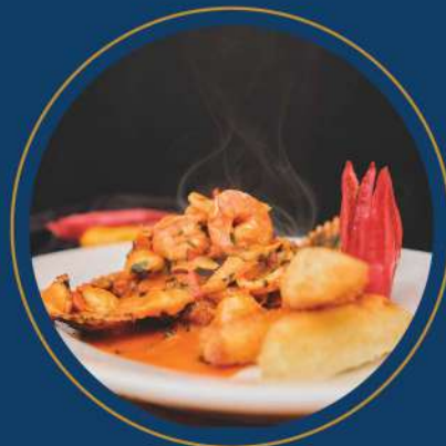
Peruvian Seafood 秘鲁海鲜