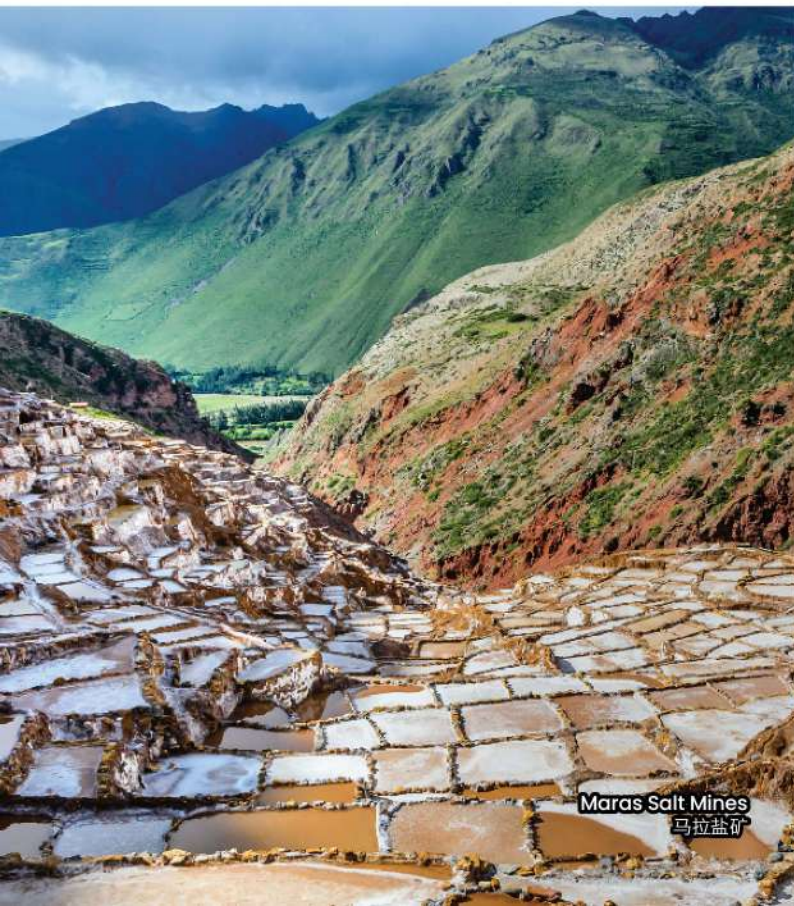
Maras Salt Mines 马拉盐矿

Sequences of itinerary are subject to local arrangement. Itineraries, meals, hotels and transportation are subject to change without prior notice.