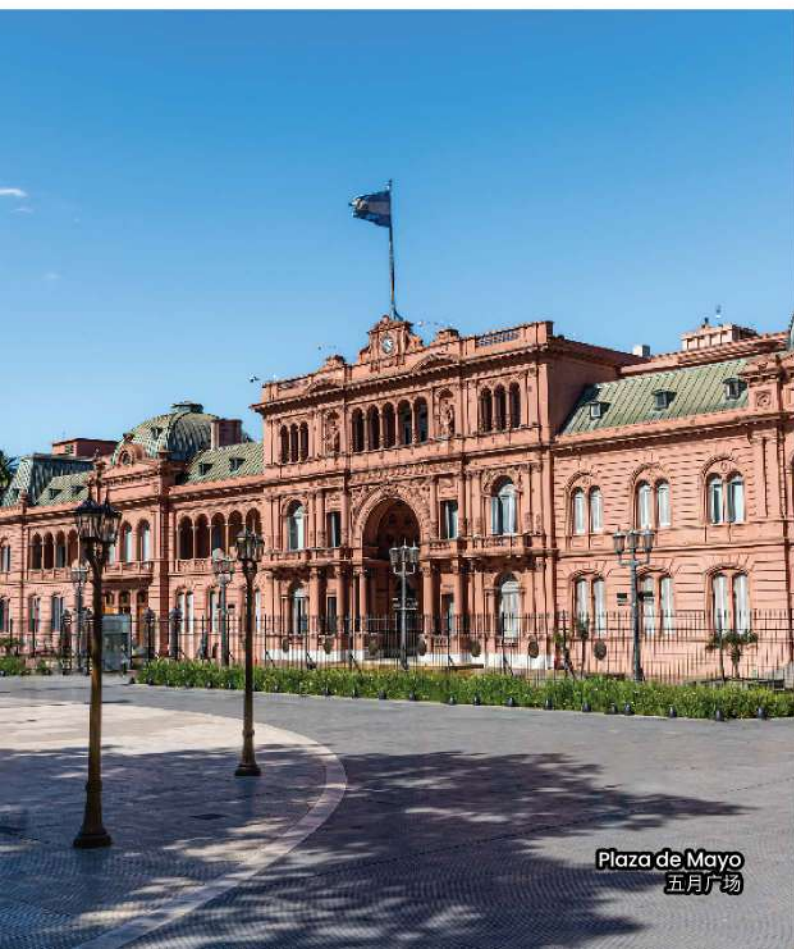
Plaza de Mayo 五月广场

行程次序以当地旅行社安排为准。行程, 膳食, 住宿, 交通等可能会因不可抗拒因素而更动, 恕不另行通知。