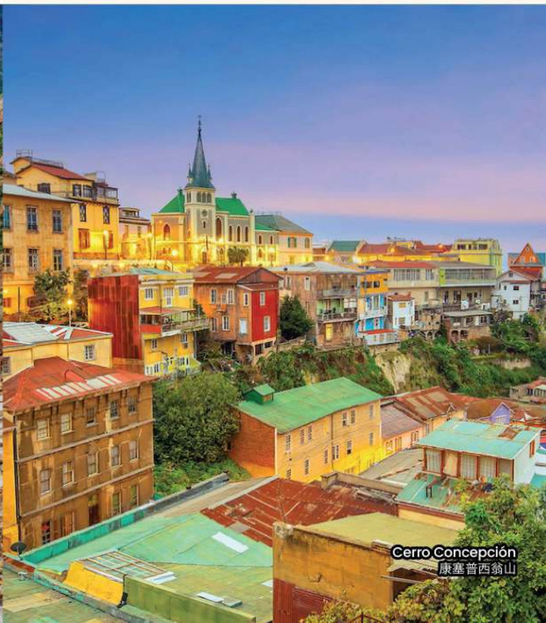
Cerro Concepción 康塞普西翁山