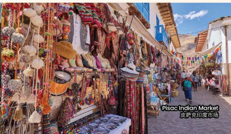
Pisac Indian Market 皮萨克印度市场