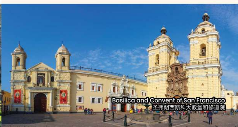
Basilica and Convent of San Francisco 圣弗朗西斯科大教堂和修道院