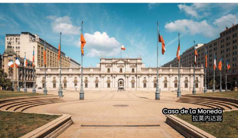
Casa de La Moneda 拉莫内达宫