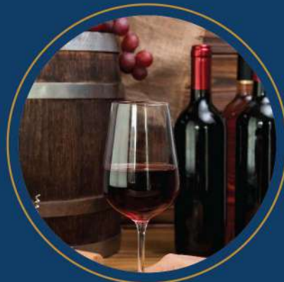
Chilean Wine 智利美酒