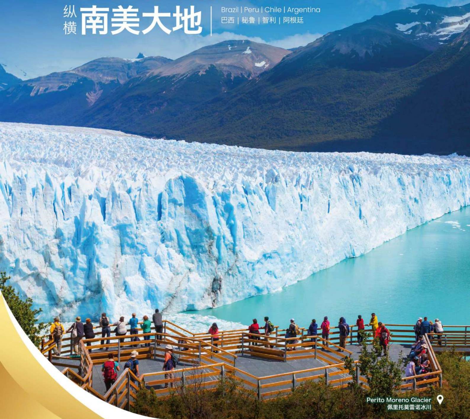
Perito Moreno Glacier 佩里托莫雷诺冰川

Brazil | Peru | Chile | Argentina 巴西 | 秘鲁 | 智利 | 阿根廷