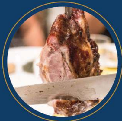
Brazilian Barbecue 巴西烤肉