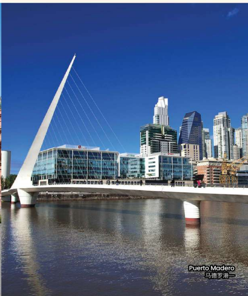
Puerto Madero 马德罗港