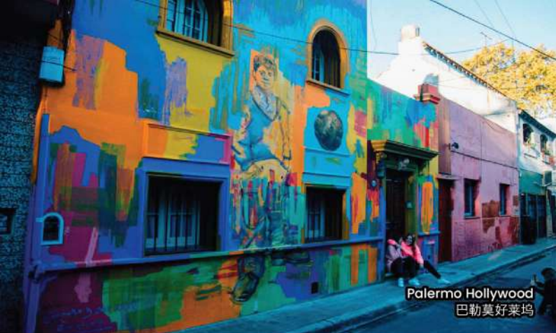
Palermo Hollywood 巴勒莫好莱坞