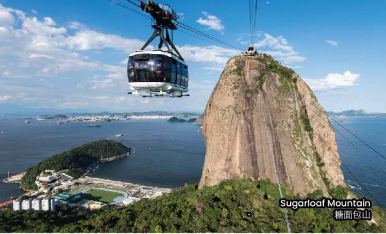
Sugarloaf Mountain 糖面包山