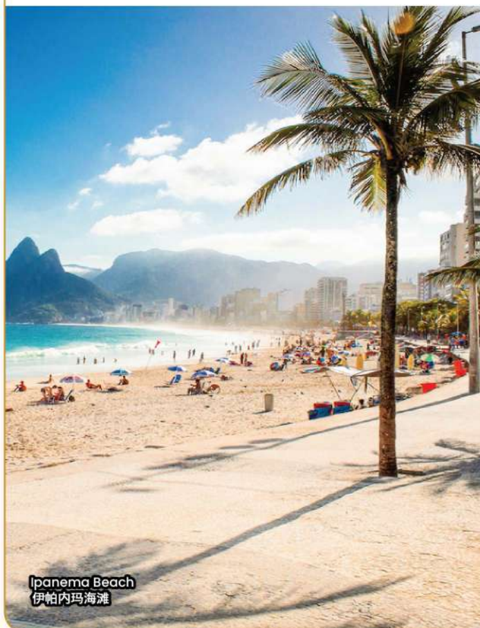
Ipanema Beach 伊帕内玛海滩