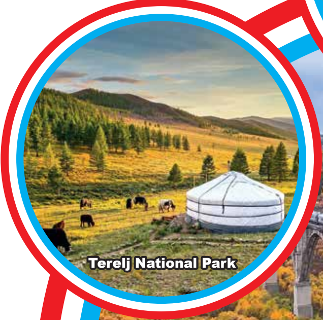
Terelj National Park