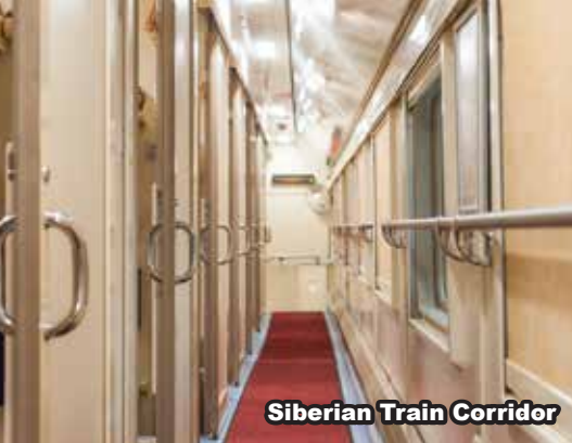
Siberian Train Corridor