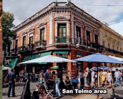
San Telmo area