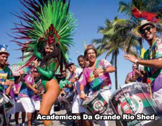
Academicos Da Grande Rio Shed