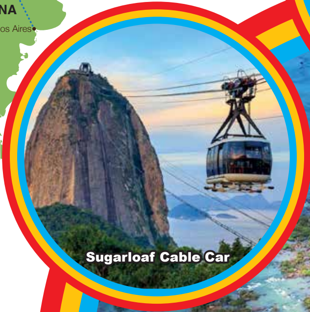
Sugarloaf Cable Car