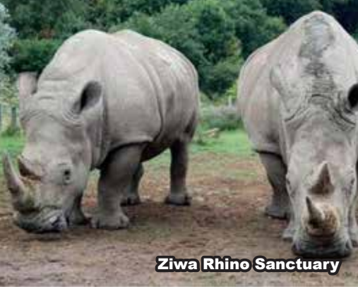
Ziwa Rhino Sanctuary