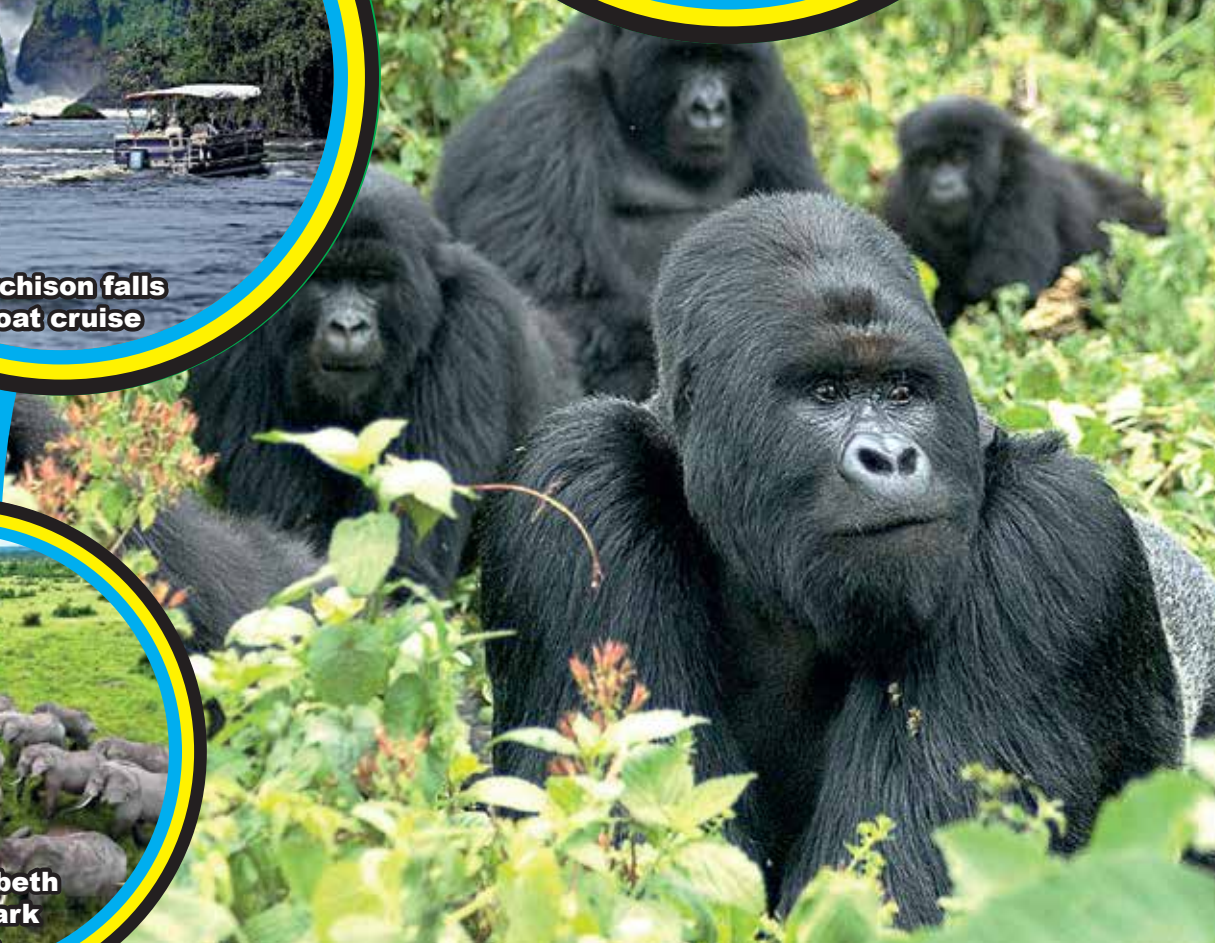
Mountain Gorillas in Uganda