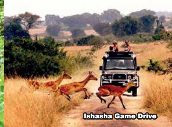
Ishasha Game Drive