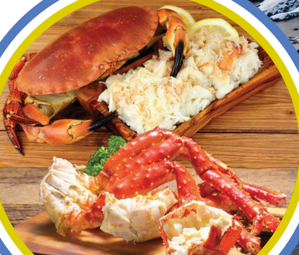
All-You-Can-Eat Brown Crab & King Crab