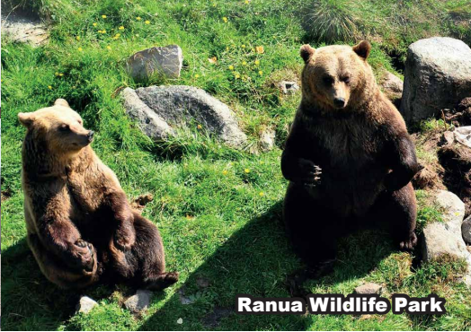
Ranua Wildlife Park