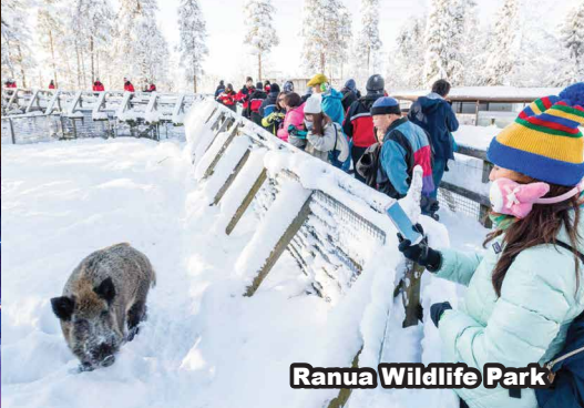
Ranua Wildlife Park