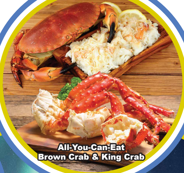
All-You-Can-Eat Brown Crab & King Crab