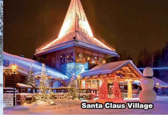
Santa Claus Village