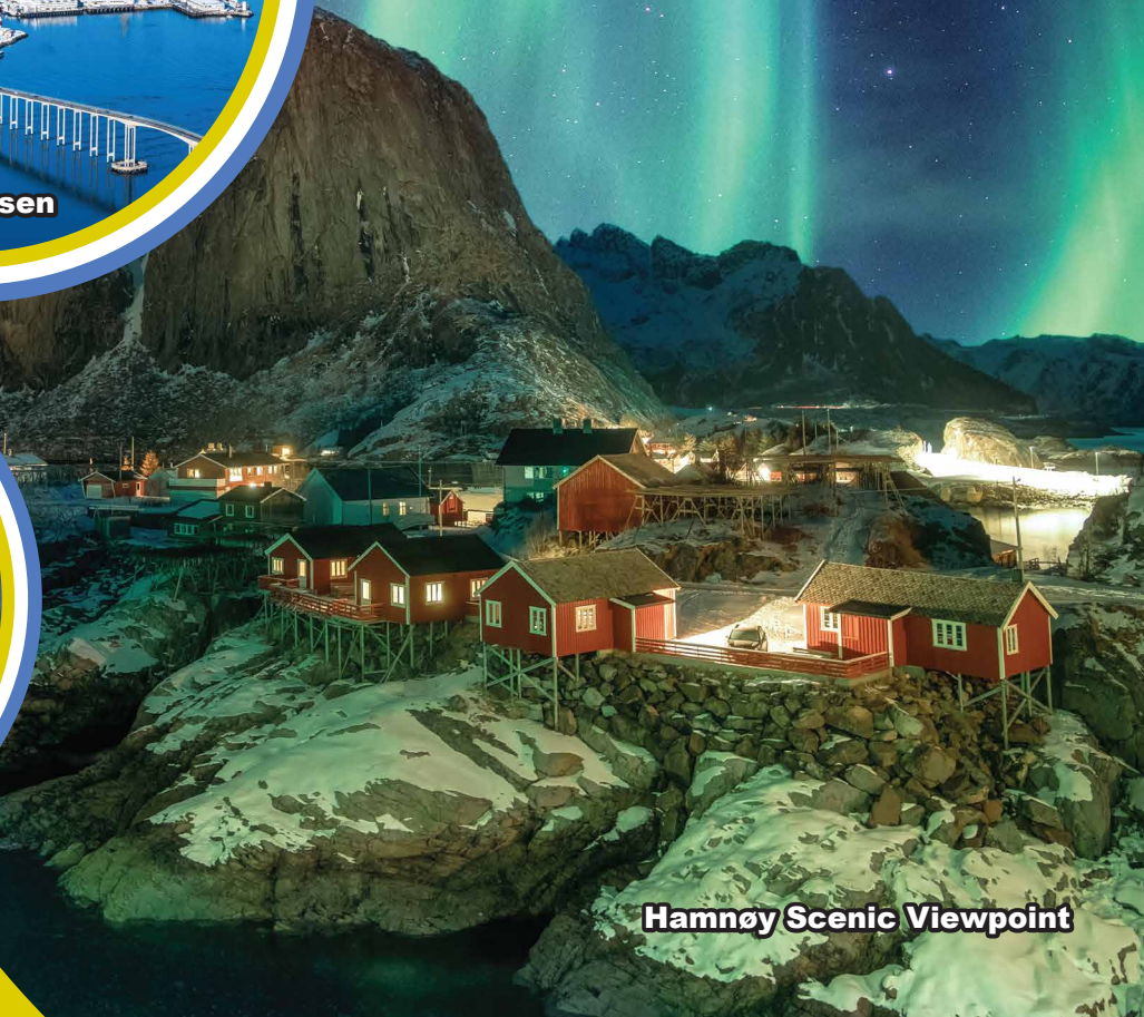
Hamnøy Scenic Viewpoint