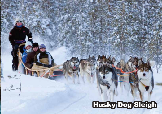
Husky Dog Sleigh