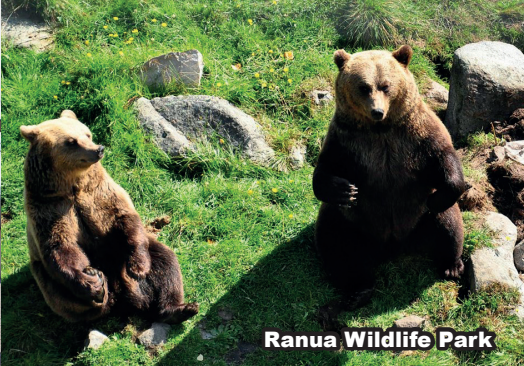
Ranua Wildlife Park