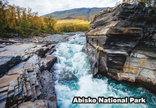
Abisko National Park