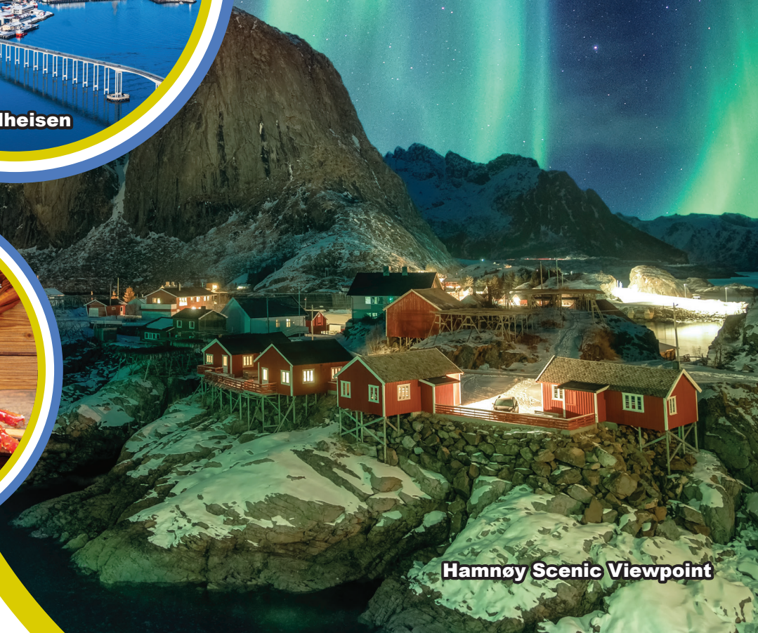
Hamnøy Scenic Viewpoint