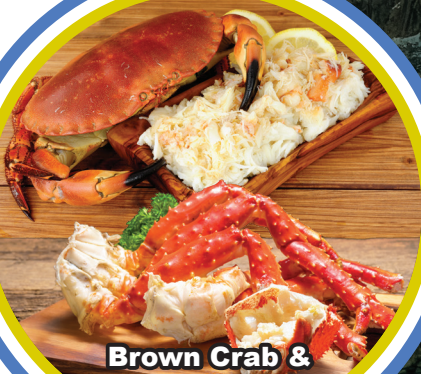
Brown Crab & King Crab