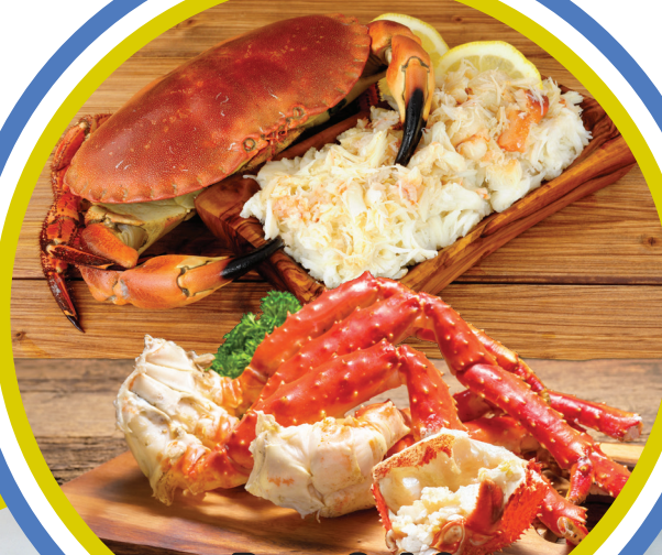
Brown Crab & King Crab