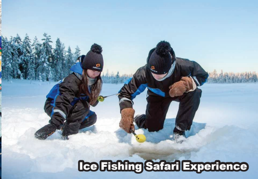
Ice Fishing Safari Experience