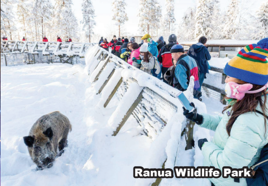
Ranua Wildlife Park