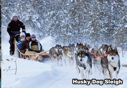
Husky Dog Sleigh