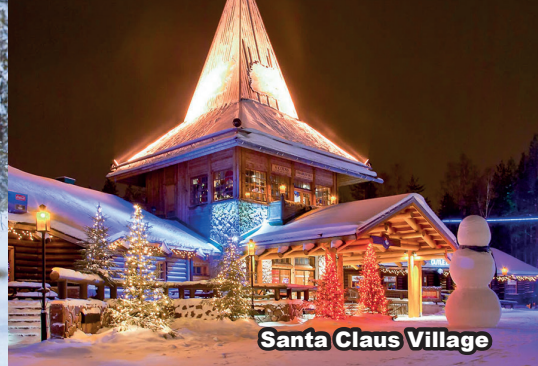
Santa Claus Village