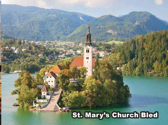
St. Mary's Church Bled