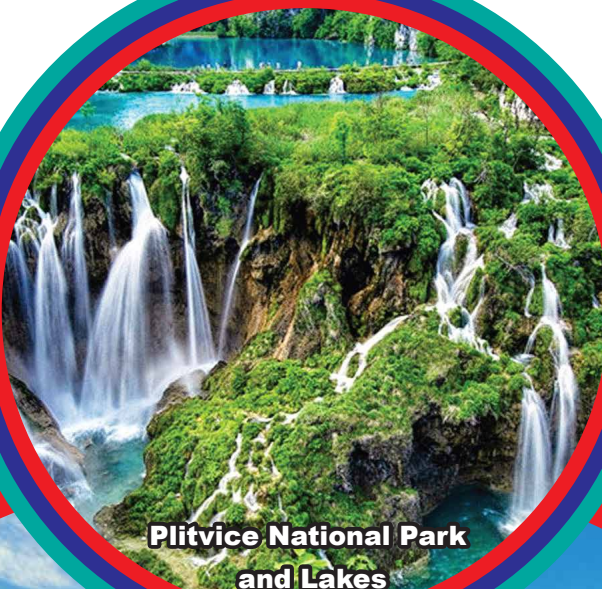
Plitvice National Park and Lakes