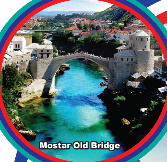
Mostar Old Bridge