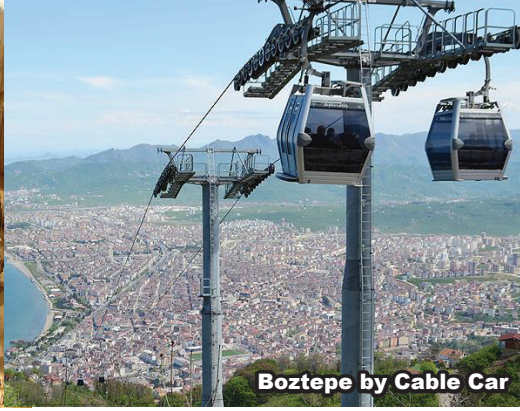
Boztepe by Cable Car