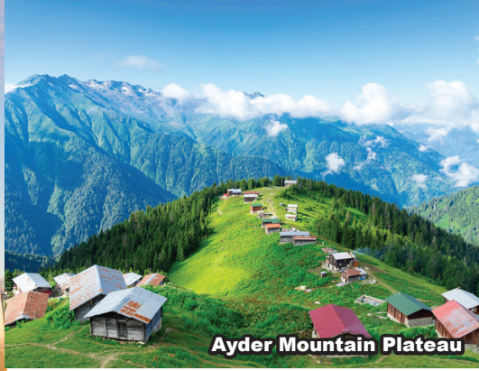
Ayder Mountain Plateau