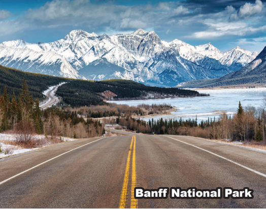
Banff National Park