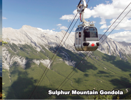
Sulphur Mountain Gondola