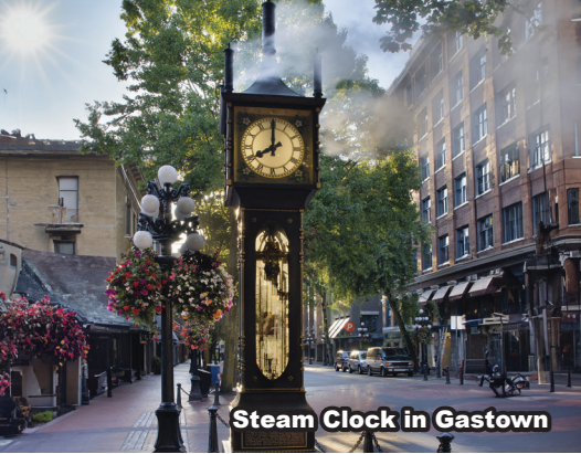
Steam Clock in Gastown