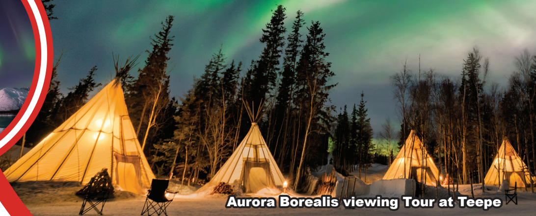
Aurora Borealis viewing Tour at Teepe