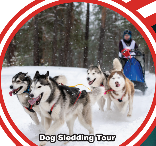
Dog Sledding Tour