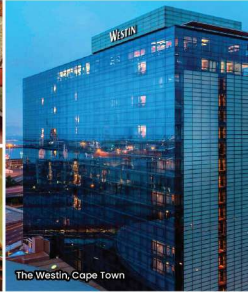
The Westin, Cape Town