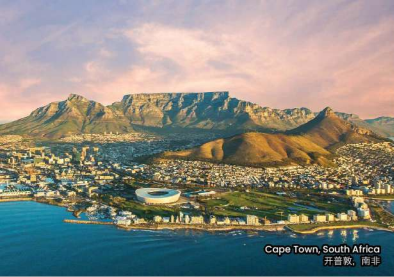
Cape Town, South Africa 开普敦, 南非