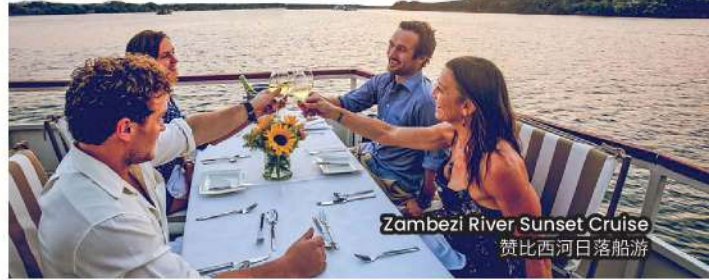
Zambezi River Sunset Cruise 赞比西河日落船游

在这个赞比西河日落晚餐船游中，感受着微风拂面， 饮料无限畅饮 ，享受晚餐，欣赏着渐渐消逝的暮色并幸运地遇到那些随时出没在河上的野生动物。