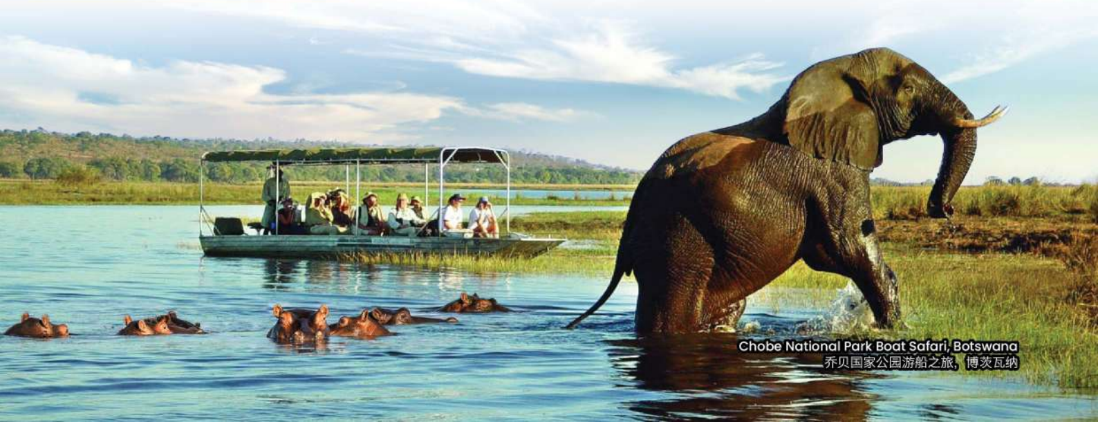
Chobe National Park Boat Safari, Botswana 乔贝国家公园游船之旅，博茨瓦纳

即使在有限的原生环境中，我们仍然会尽力为您提供最佳的住宿安排。同样会仔细筛选酒店的房型和地理位置，以确保提供符合标准的住宿体验。从而您能够真正了解并体会当地朴实无华的生活方式，这何曾不是一种另类的旅游体验吗？