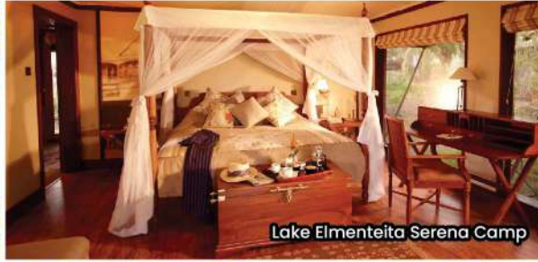
Lake Elmenteita Serena Camp