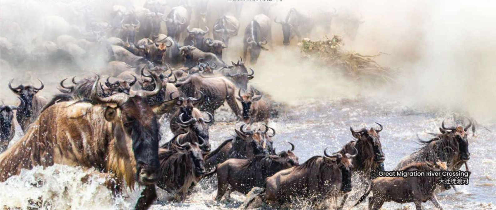
Great Migration River Crossing 大迁徙渡河

马赛马拉国家公园不可错过的精彩和可遇不可求的非洲大迁徙。每年大约从7月至9月是关键观赏季，数百万的角马、斑马和其他草食动物为了寻找水源及食物，於雨季和旱季交错的环境下开始从坦桑尼亚的塞伦盖蒂草原过马拉河迁徙，过程中会经历出生、受孕、饥饿、干渴、体力不支、受伤、被天敌猎食，成功抵达了也就等于完成使命及自然界的循环。