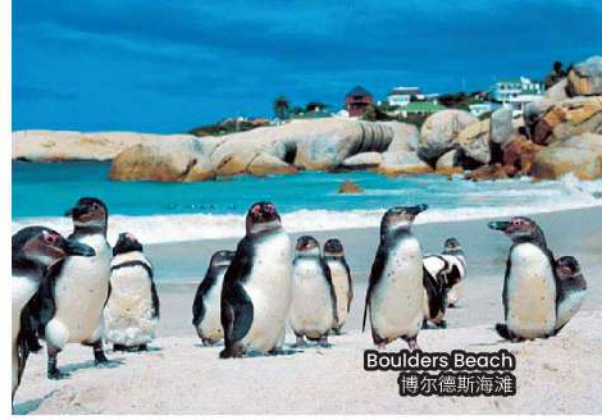
Boulders Beach 博尔德斯海滩