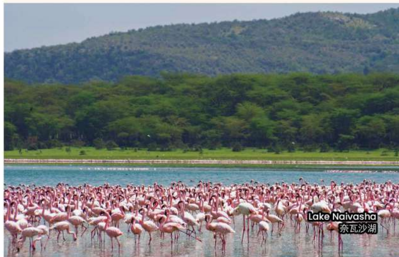
Lake Naivasha 奈瓦沙湖