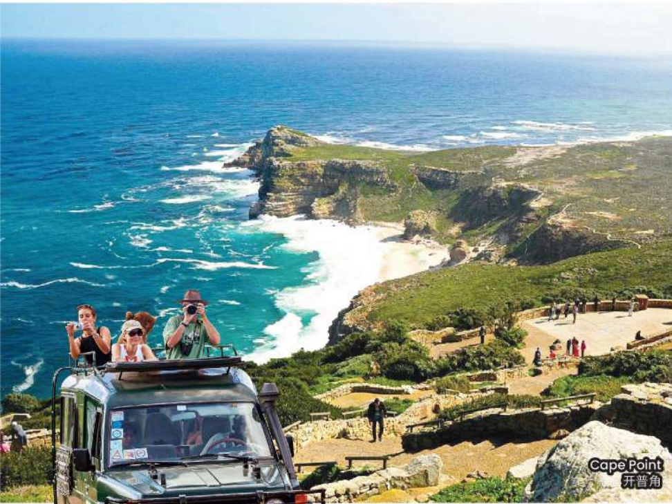
Cape Point 开普角