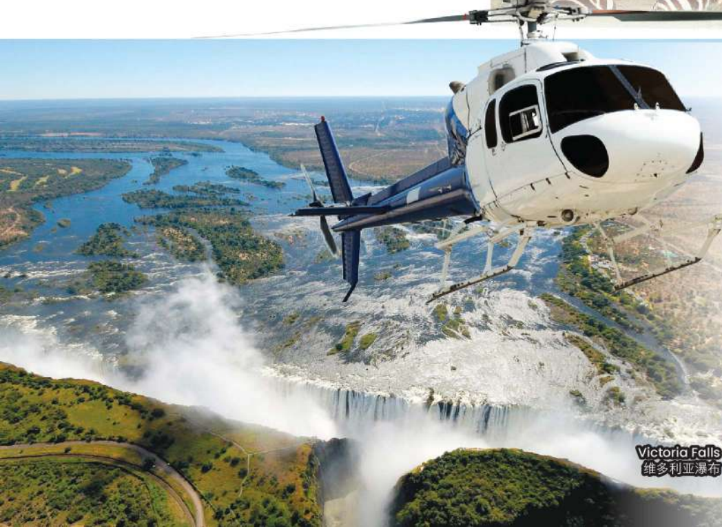
Victoria Falls 维多利亚瀑布