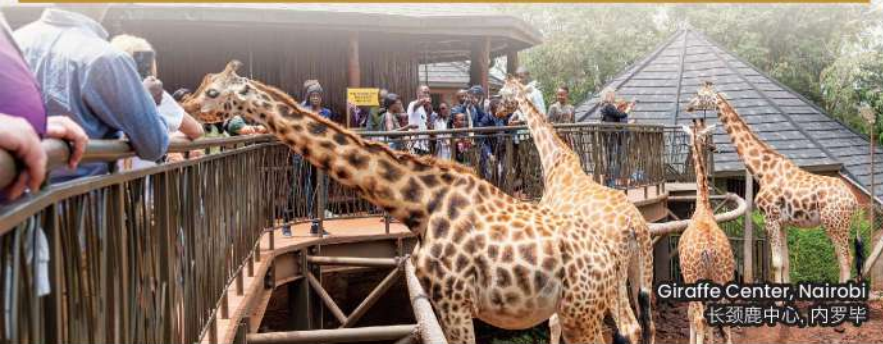
Giraffe Center, Nairobi 长颈鹿中心, 内罗毕

Total Stay: Kenya - 4 nights, Zimbabwe - 3 nights, South Africa - 2 nights