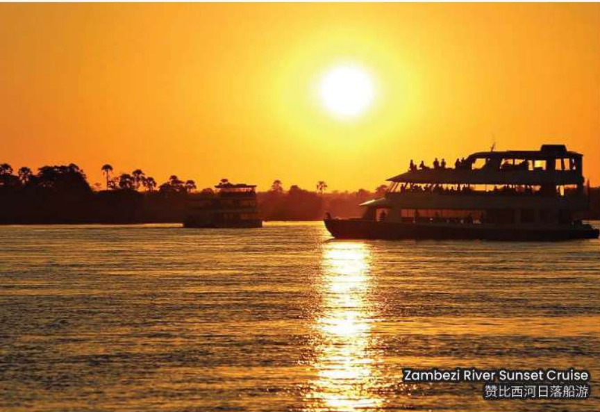
Zambezi River Sunset Cruise 赞比西河日落船游

Vibes to create joyful moment together 共创愉悦片刻