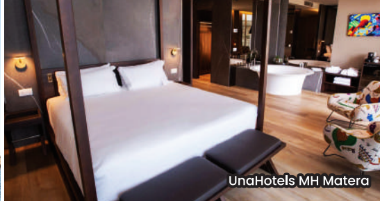
UnaHotels MH Matera