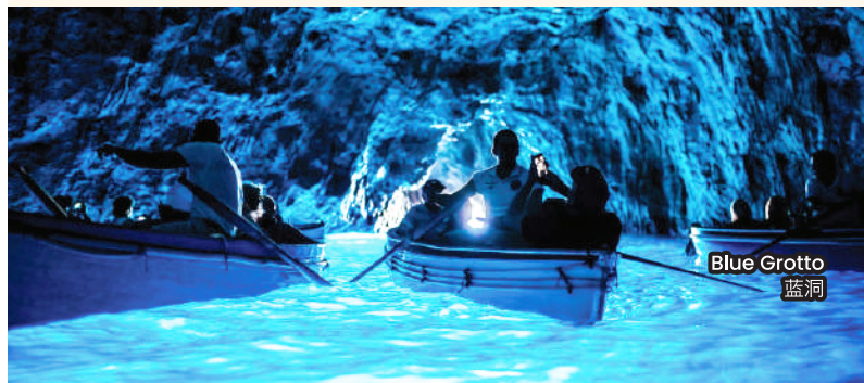
Blue Grotto 蓝洞

免责声明: 行程次序以当地旅行社安排为准。行程, 膳食, 住宿, 交通等可能会因不可抗拒因素而更动, 恕不另行通知。