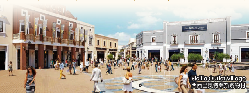
Sicilia Outlet Village 西西里奥特莱斯购物村