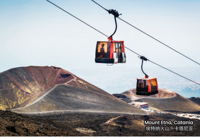
Mount Etna, Catania 埃特纳火山, 卡塔尼亚