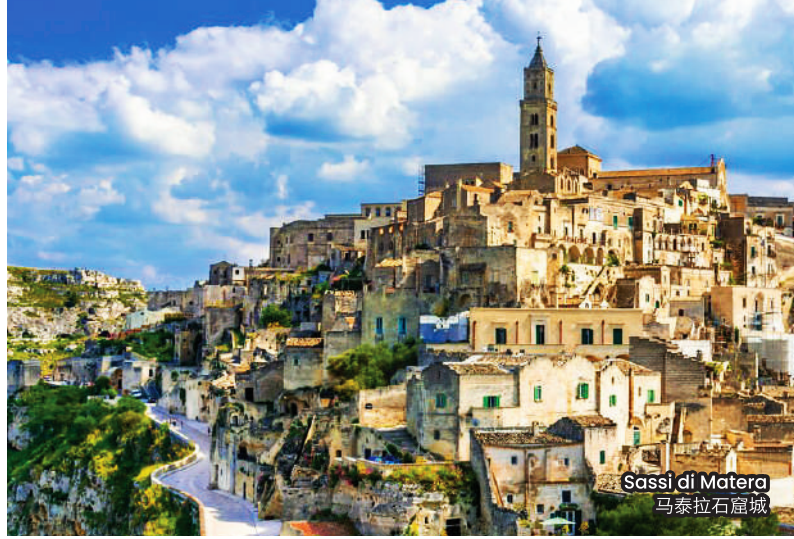
Sassi di Matera 马泰拉石窟城

NAPLES / POMPEII / SORRENTO / CAPRI ISLAND / MATERA / TROPEA / MESSINA / TAORMINA / CATANIA / MALTA