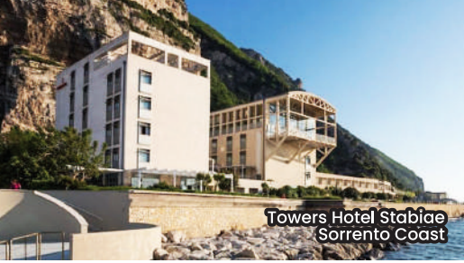
Towers Hotel Stabiae Sorrento Coast