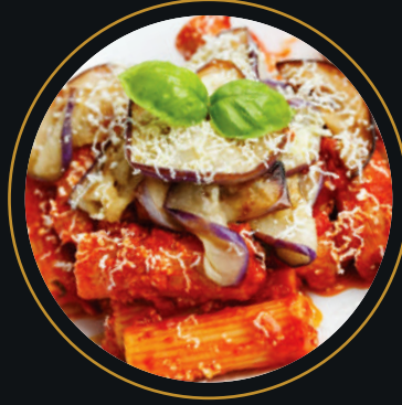
Pasta alla Norma