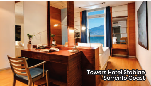
Towers Hotel Stabiae Sorrento Coast