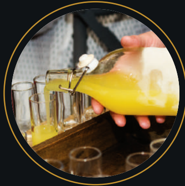
Limoncello di Sicilia