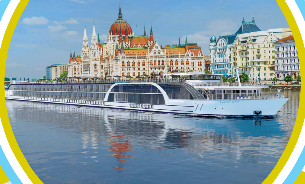
Danube River Cruise