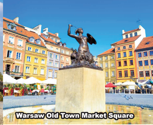
Warsaw Old Town Market Square