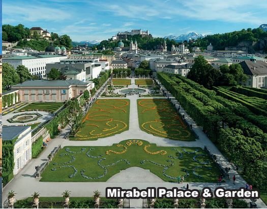
Mirabell Palace & Garden