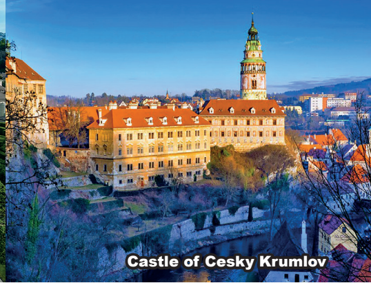
Castle of Cesky Krumlov