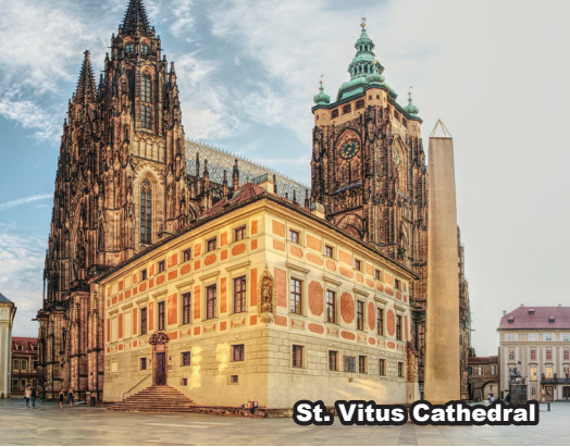
St. Vitus Cathedral