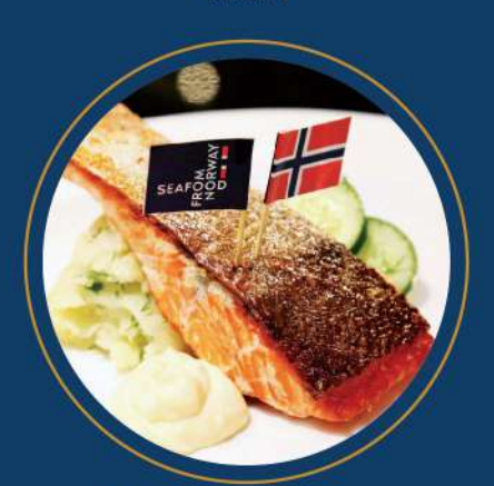
Norwegian Salmon 挪威三文鱼