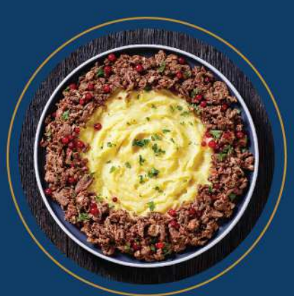
Reindeer Meat 驯鹿肉