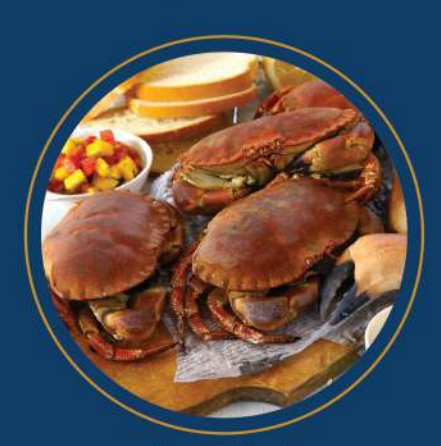
Brown Crab 面包蟹