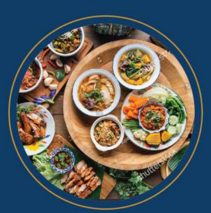
Thai Meal 泰式餐