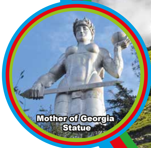
Mother of Georgia Statue