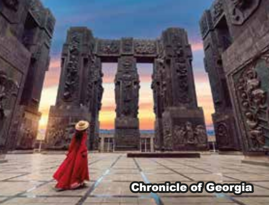
Chronicle of Georgia