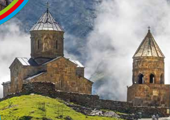
Gergeti Trinity Church