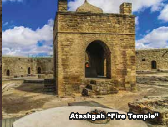
Atashgah "Fire Temple"