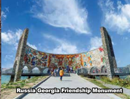
Russia Georgia Friendship Monument