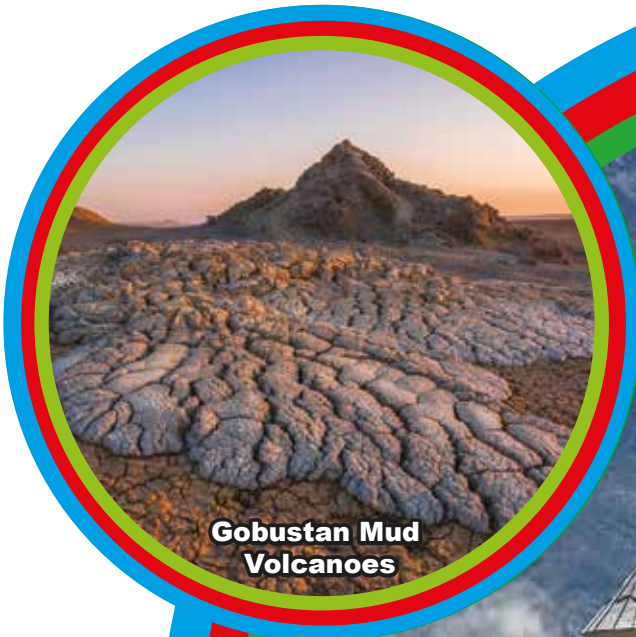
Gobustan Mud Volcanoes