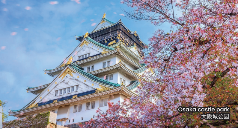
Osaka castle park 大阪城公園

OSAKA | WAKAYAMA | GIFU | TOYAMA | NAGANO | YAMANASHI | AICHI | MIE | TOKYO