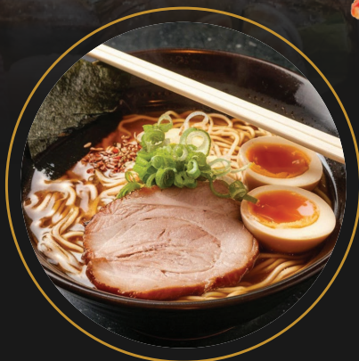
World Famous Ramen 世界著名拉面