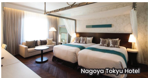
Nagoya Tokyu Hotel