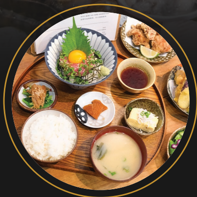
Rustic Japanese Set 日本乡村风味