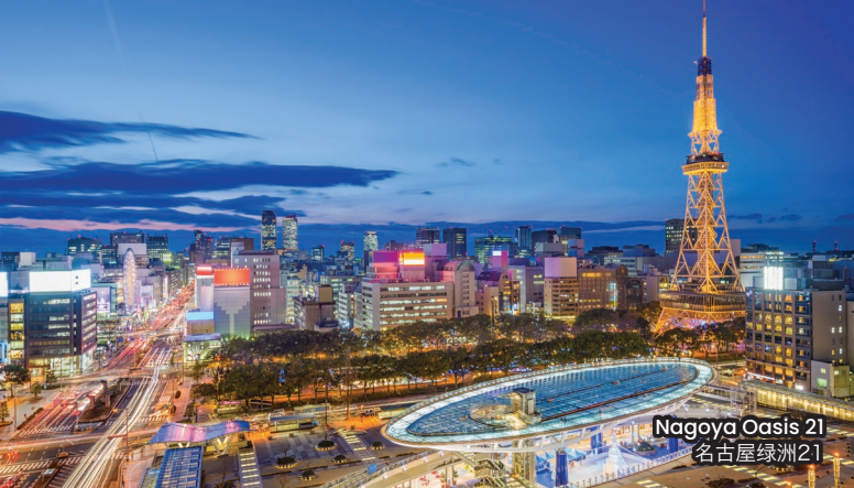
Nagoya Oasis 21 名古屋绿洲21

大阪 | 和歌山 | 岐阜 | 富山 | 长野 | 山梨 | 爱知 | 三重 | 东京