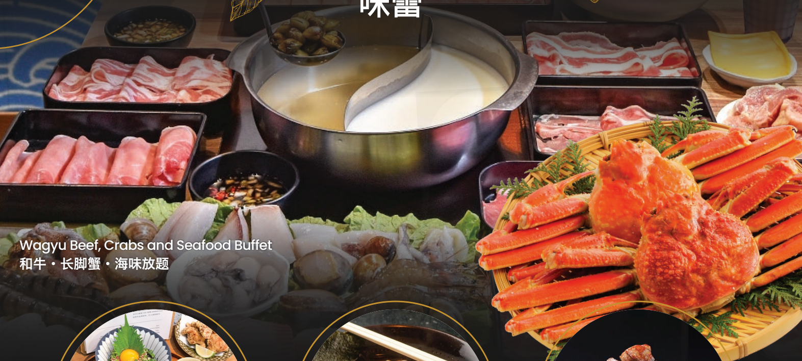
Wagyu Beef, Crabs and Seafood Buffet 和牛·长脚蟹·海味放題