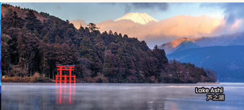
Lake Ashi 芦之湖