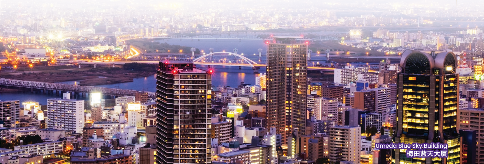
Umeda Blue Sky Building 梅田蓝天大厦

愿这趟旅程，为您留下温暖而难忘的回忆，带着一份宁静与满足，尽情享受旅途中每一刻的风景与故事。