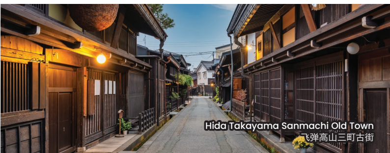
Hida Takayama Sanmachi Old Town 飛騨高山三町古街

Sequences of itinerary are subject to local arrangement. Itineraries, meals, hotels and transportation are subject to change without prior notice.