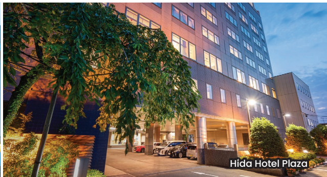
Hida Hotel Plaza