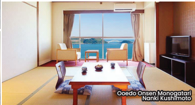
Ooedo Onsen Monogatari Nanki Kushimoto