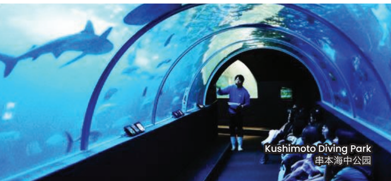
Kushimoto Diving Park 串本海中公园

行程次序以当地旅行社安排为准。行程，膳食，住宿，交通等可能会因不可抗力因素而更动，恕不另行通知。