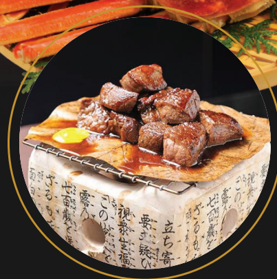
Miso Yaki 香叶味噌烧