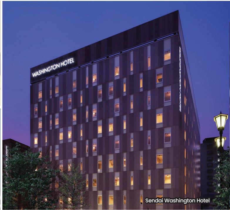
Sendai Washington Hotel