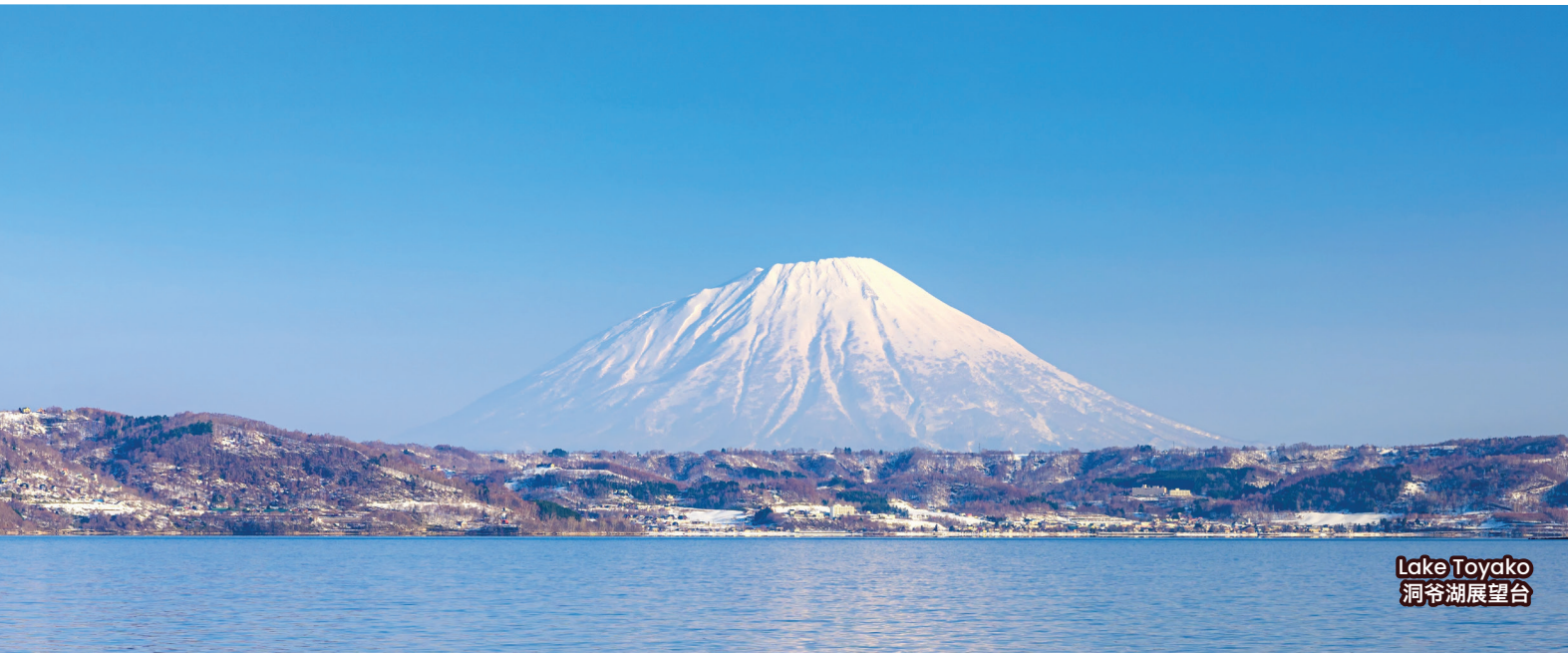
Lake Toyako 洞爷湖展望台