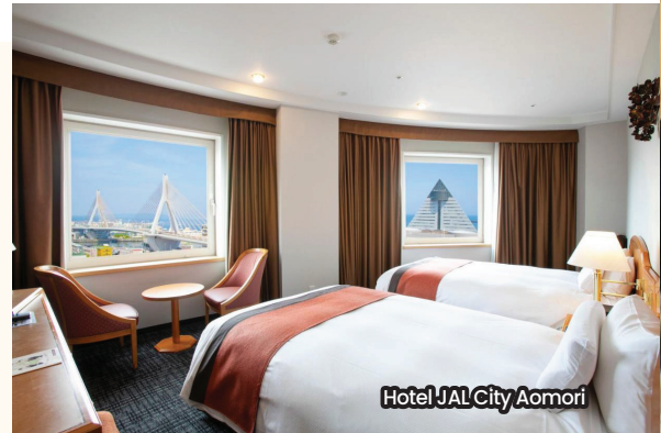
Hotel JAL City Aomori