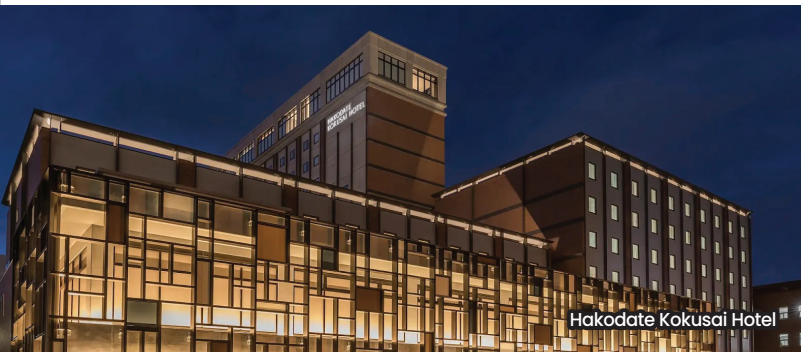
Hakodate Kokusai Hotel