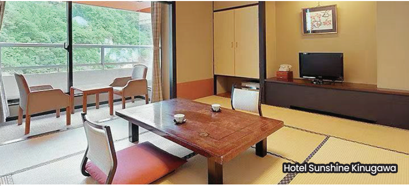
Hotel Sunshine Kinugawa