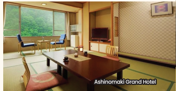
Ashinomaki Grand Hotel