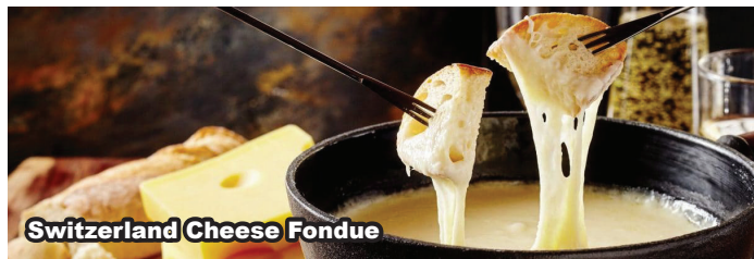
Switzerland Cheese Fondue

*During major conferences, fairs, and festivals, accommodation may be located in an alternative city without prior notice *Some accommodations may not have specific twin or double room types