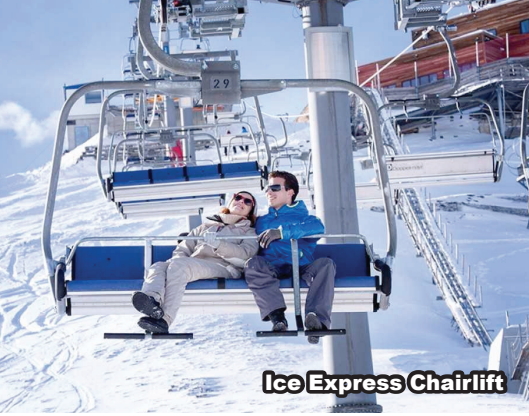
Ice Express Chairlift