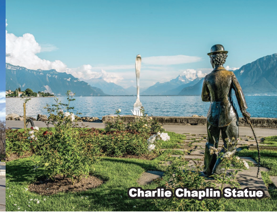
Charlie Chaplin Statue