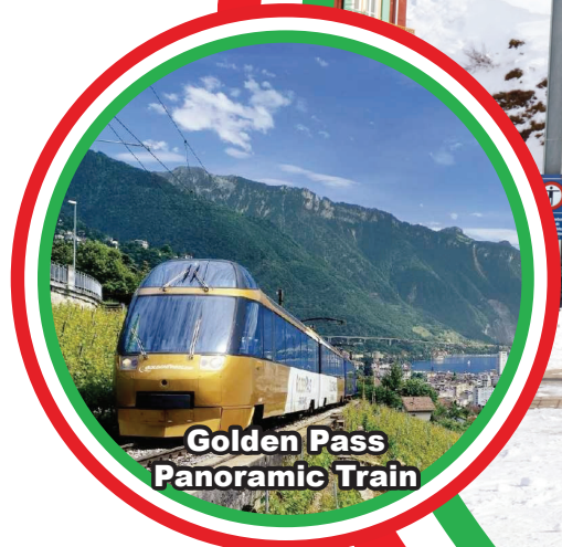
Golden Pass Panoramic Train