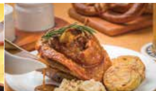
3 Course Meal –German Lunch with Pork Knuckle

*During major conferences, fairs, and festivals, accommodation may be located in an alternative city without prior notice