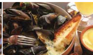
3 Course Meal –Mussels Meals