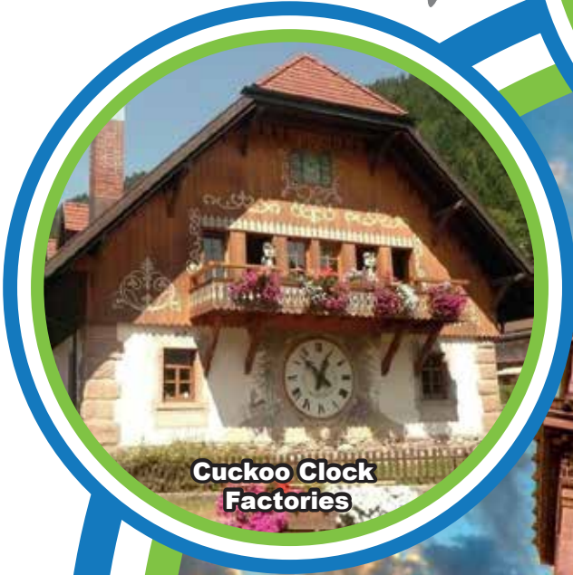
Cuckoo Clock Factories