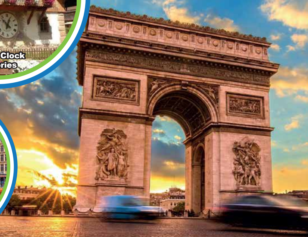
Arch of Triumph