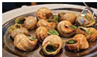
3 Course Meal –French Cuisine with Escargot