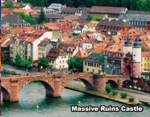
Massive Ruins Castle